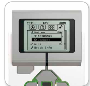
Connect to network