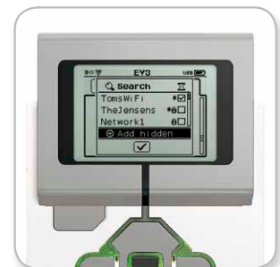
Add hidden network