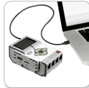
USB Cable connection

Using the USB Cable, plug the Mini-USB end into the EV3 Brick's PC port (located next to Port D). Plug the USB end into your computer.