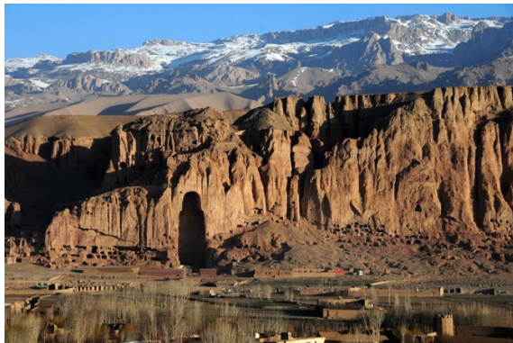
The Bamyan Mountains of Afghanistan