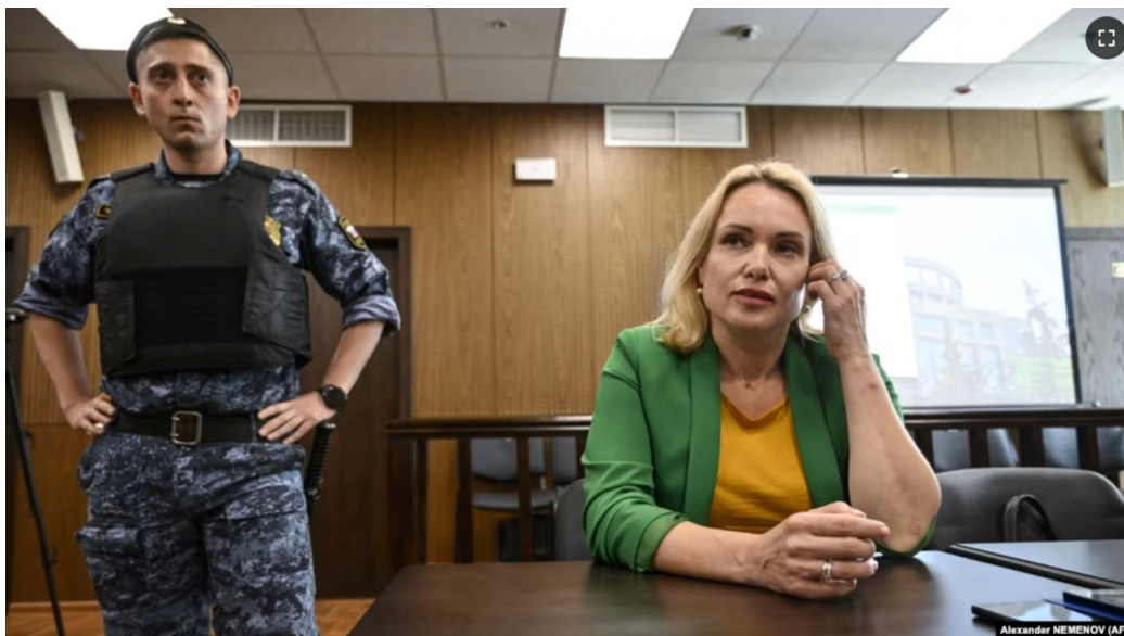
Marina Ovsyannikova being interrogated in Moscow, Russia (March 2022)