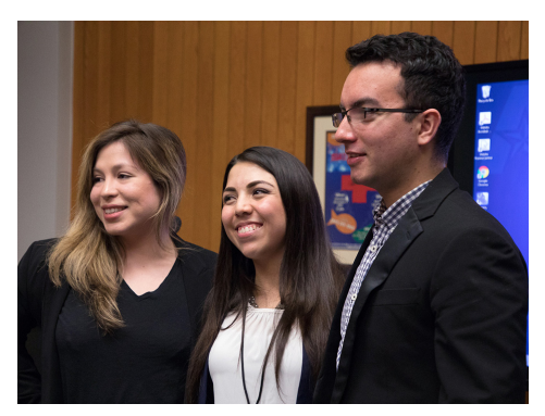
Presenters at the Hispanic/Latino Media & Marketing International Conference.

The Harris Institute and the Department of Communication at the University of Texas at Arlington co-hosted the Seventh Bi-annual Hispanic/Latino Media & Marketing International Conference in Arlington, Feb. 21–23, 2019. The conference offered academic research presentations, industry-focused panels, and skills workshops led by media professionals. Undergraduate and graduate students attended a career expo where they interacted with media practitioners and researchers alike. The Harris Institute was pleased to sponsor transportation and lodging costs for more than 35 students and faculty members from the College of Media & Communication. For more information, or to view the conference program, visit almmacr.com/conference.