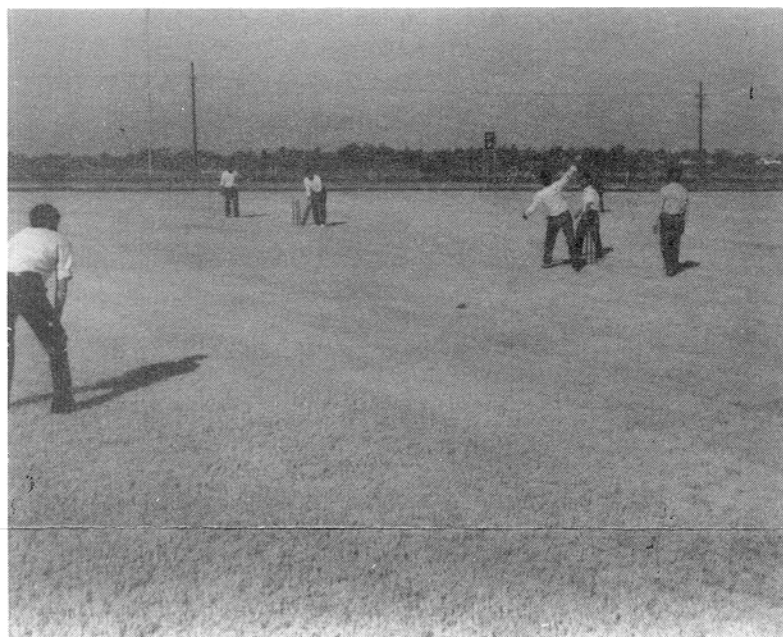
"Batter Up"?, "Play Ball"?, or Whatever

(Maybe we should teach the students to play baseball next time?)