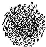
Ring Yarn Cross section