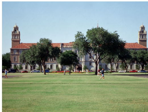
Texas Tech has a wide range of academic programs for you to explore. From here, it's possible

Student must maintain a 3.0 GPA at Texas Tech and make a B- or better in each course taken at the university. Earning a C in a course will warrant probation.