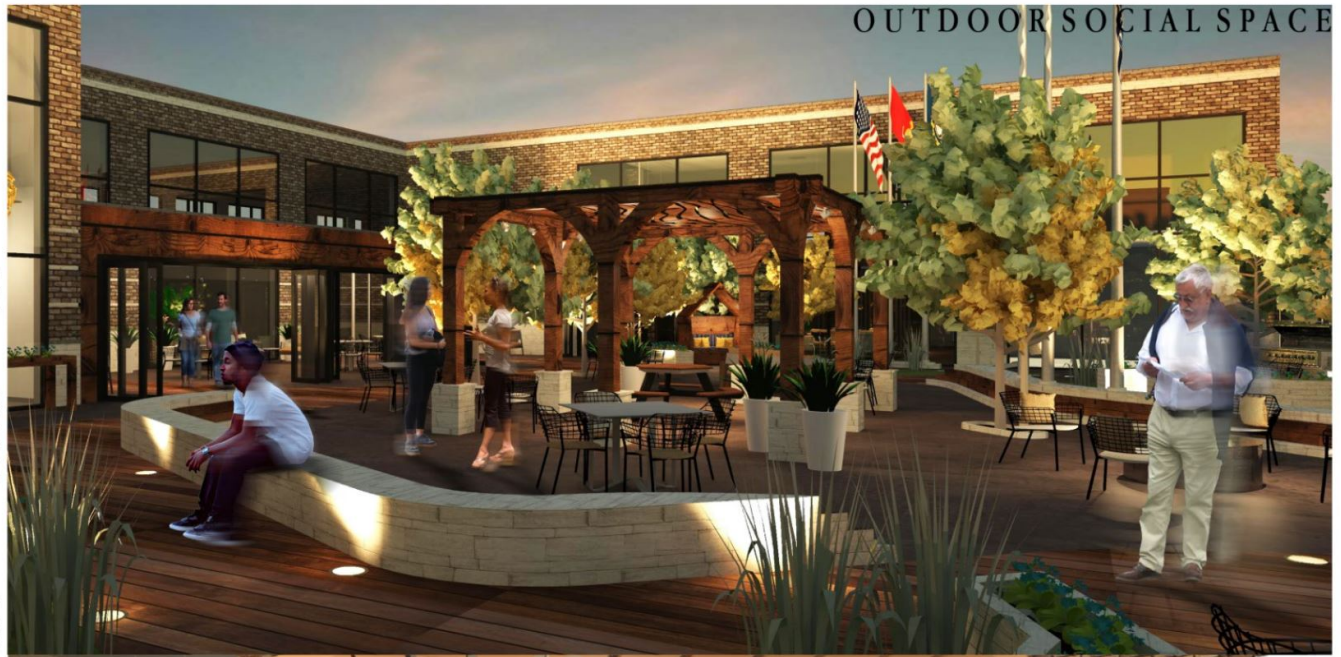
OUTDOOR SOCIAL SPACE