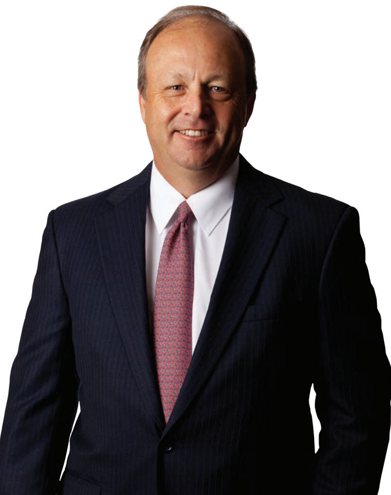
Alumni at the helm: managing private law firms pg. 11