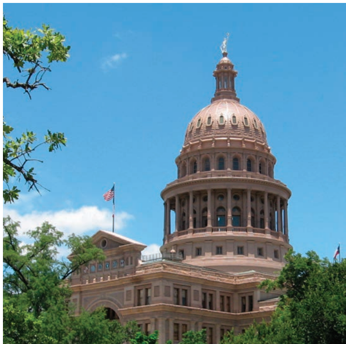
ON THE COVER Making Texas history in the state Capitol pg. 15