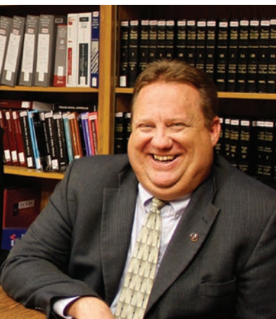
Three alumni return to support clinical programs pg. 10