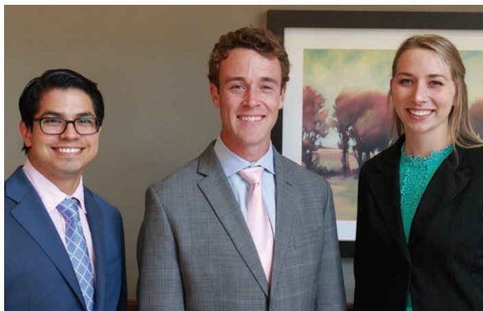
First full term for the Pro Bono Program pg. 8