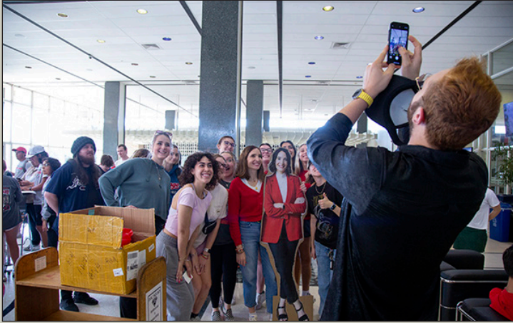
First-year students from the J.T. & Margaret Talkington College of Visual & Performing Arts engage with the University Library through a scavenger hunt.