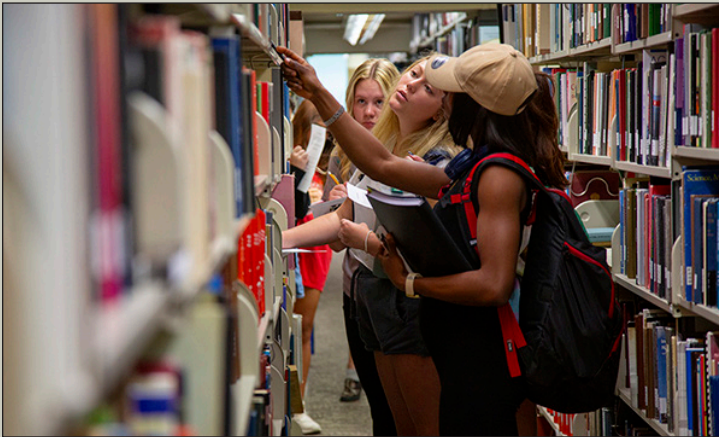
Students from the Texas Tech Women's & Gender Studies program tour the Stacks in the University Library.