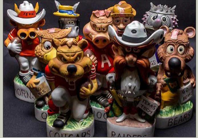
The Southwest Collection/Special Collections Library ( bit.ly/SouthwestLibrary ) is one of the premier academic sports archives in the country and is home to the Southwest Athletic Conference collection, the National College Baseball Hall of Fame, the Big 8 and Big XII Conferences and more.