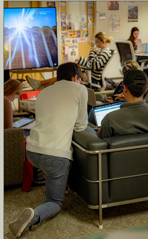
In collaboration with librarians, tutors from the Texas Tech Learning Center work with students in the Library's Research Hub.