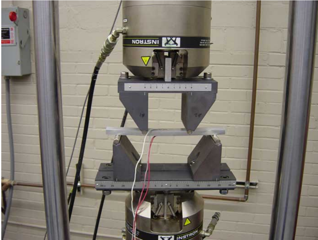
Close-up of Bend Fixture

The desired result from the bend is a section between the inner contact points that has constant stress properties. To assure this requirement, a test bend will be performed with 5 strain gauges positioned on the bar as seen below. Unfortunately, due to a limitation of our equipment, only 4 of the strain gauges can be read and recorded at any given time. Therefore, the gauges labeled 21 and 22, will be traded for each other between tests. After the test, the gauges 1 and 2, and 3 and 4 can be compared to assure that there are no unwanted torsion forces being created by the test fixture.