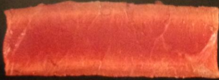
VERY RARE Approx. 130°F, 55°C