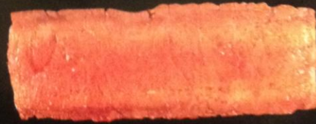
RARE Approx. 140°F, 60°C