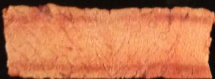
WELL DONE Approx. 170°F, 77°C