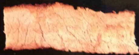
VERY WELL DONE Approx. 180°F, 82°C