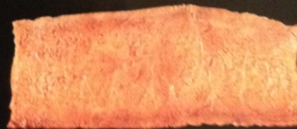
MEDIUM Approx. 160°F, 71°C