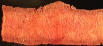
MEDIUM RARE Approx. 145°F, 63°C