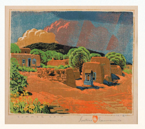
Gustave Baumann (1881 – 1971) Summer Rain, 1926 Woodcut Museum Purchase