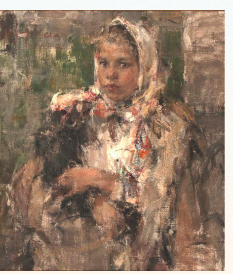
Nicolai Ivanovich Fechin (1881 – 1955) Peasant Girl, 1913 – 1923 Oil on Canvas, Gift of the Margaret Talkington Estate

NOW, IT'S YOUR TURN! DRAW A PORTRAIT OF Someone or your own self-portrait in the space below!