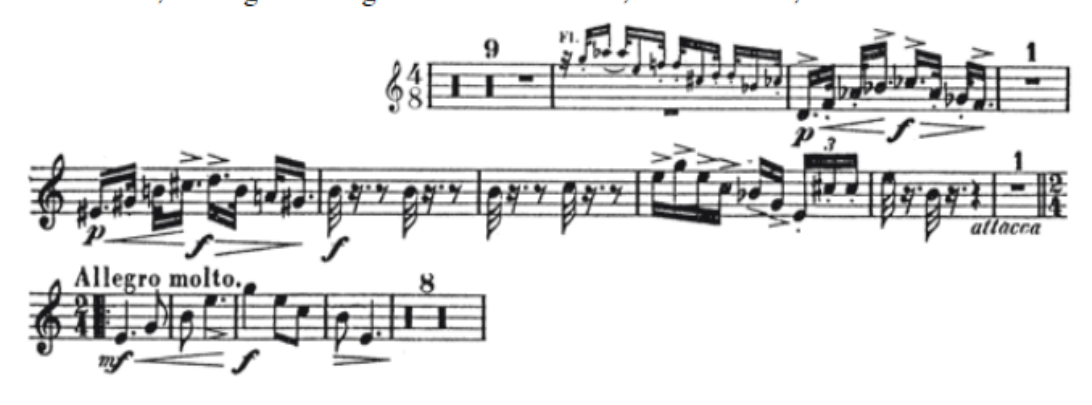
Horn 3 in E, IV. Allegro con fuoco quarter = 152, ms. 1-25

Horn 3 in C, I. Adagio – Allegro molto 16th = 126, ¼ note = 136, ms. 16-27