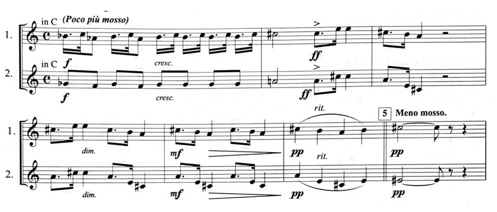
Antonin Dvorak Symphony No. 9 - IV. Allegro con fuoco Measures 8-25 Trumpet 1 in E

Antonin Dvorak Symphony No. 9 - II. Largo 6 measures after Reh. 4 - Reh. 5 Trumpet 1 in C