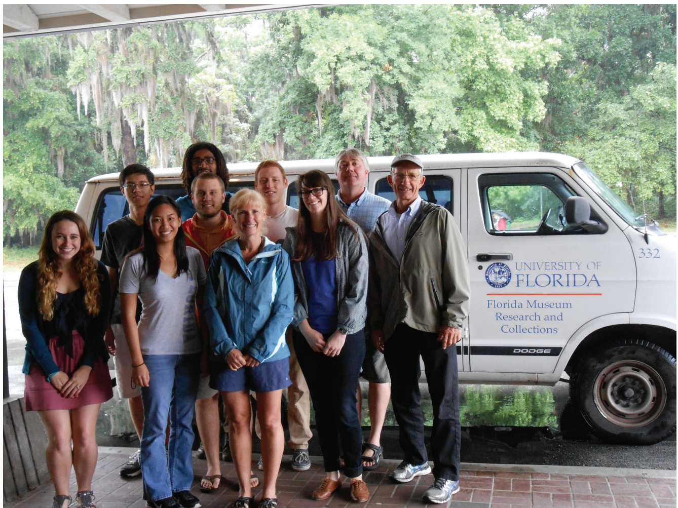
Figure 3. University of Florida undergraduate biology students on a museum field trip to collect plant specimens at the Ordway-Swisher Biological Station.

data. If they desire to do so, instructors can enhance the comparative component of the exercise by having different student groups focus on different plant species or conceptual issues. By coordinating with other instructors to conduct this exercise simultaneously at multiple institutions, students from different programs can interact online to enhance learning, foster interactions, and develop a collective and more collaborative perspective on scientific problem solving.