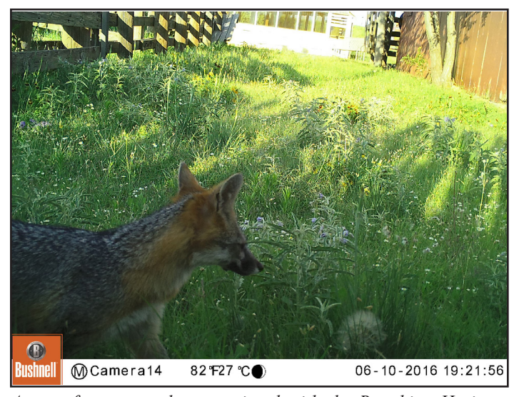
A gray fox near a den associated with the Ranching Heritage Center, Lubbock, Texas.

With this as a background, we have been performing a camera-based research project in Lubbock, Texas, as a means by which to provide some of the first formal research into urban mesocarnivore presence and occupancy patterns in the Southern Great Plains of Texas. Ideally, this research will provide insights regarding mesocarnivore affinities for certain portions of the city, and help to inform city managers and neighborhoods as to how to minimize potential human-wildlife conflicts.