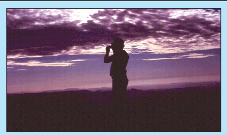
Looking for good students! Bradley in Davis Mountains, Texas.

ecule might be a crucial reproductive isolation mechanism in mammals, ensuring only species-specific fertilization and successful formation of non-hybrid offspring. I am exploring molecular evolution of zonadhesin in three experimental approaches. First, I am determining the role of zonadhesin in mammalian evolution at the ordinal and super-ordinal level by constructing phylogenies of all mammalian orders. Second, I am examining rodent species that are known to hybridize, including pocket gophers ( Geomys ), wood rats ( Neotoma ), and ground squirrels ( Ictidomys ). Lastly, I am investigating the process of alternative mRNA splicing in zonadhesin, which may contribute to the rapid molecular evolution and radiation events seen in rodents."