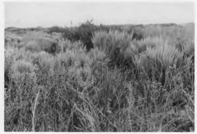
Fig. 8.—Sand sage-ragweed-yucca disclimax, north of Sudan, Lamb County.