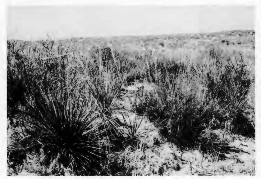
Fig. 6.-Mixed grass-yucca community, north of Fieldton, Lamb County.