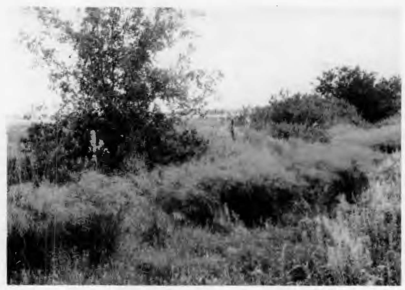
Fig. 4.-Hackberry-shrub community, south of Olton, Lamb County.