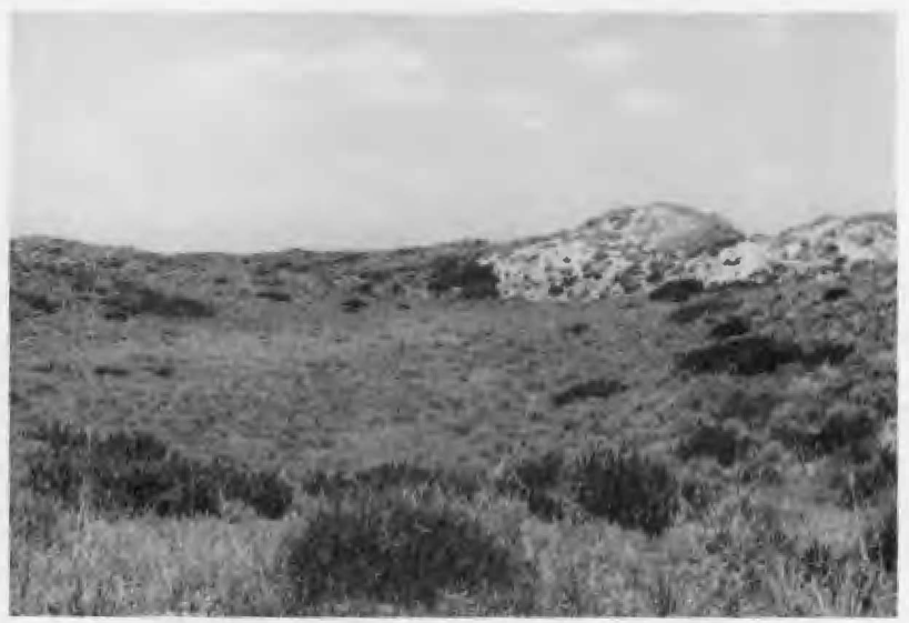
Fig. 9.—Intergrading communities of sand sage, Havard shin oak, and grasses west of Muleshoe, Bailey County.