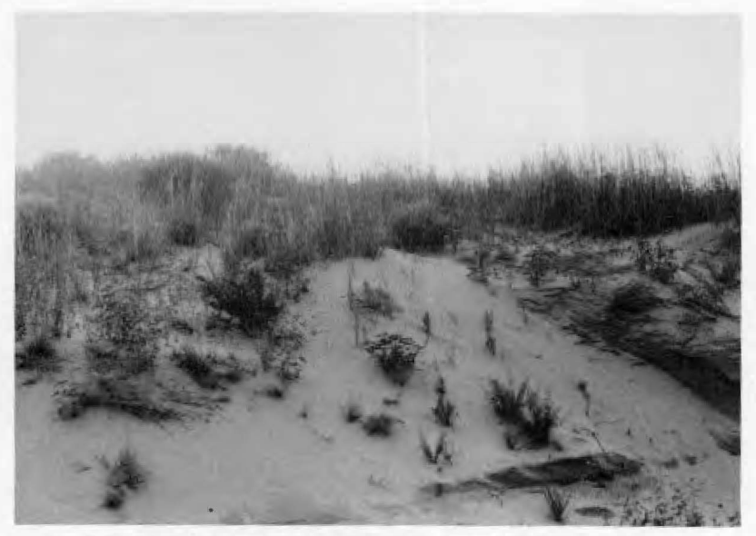
Fig. 3.—Sand dune in process of stabilization, western Bailey County.

and average daily minima 20.0° and 63.7°, respectively). The average annual daily minimum and maximum temperatures were 41.3° and 72.5°.