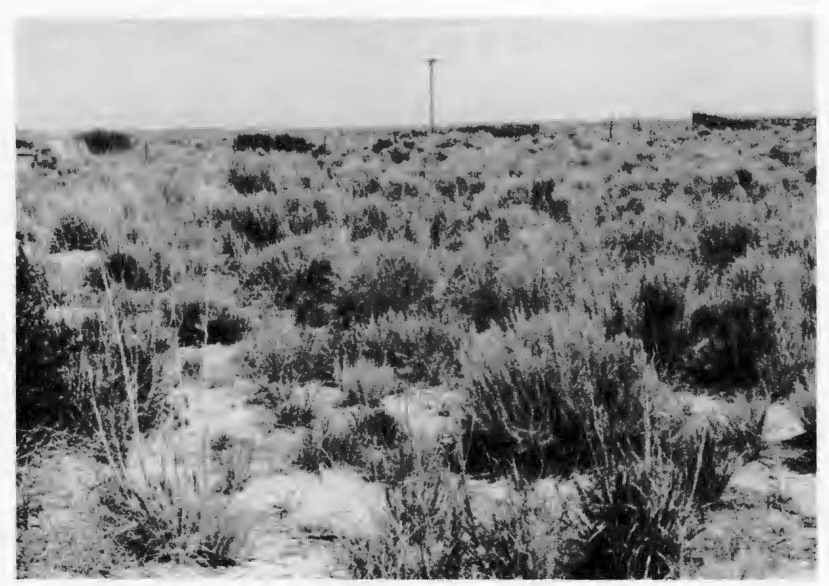
Fig. 7.—Sand sage-midgrass community, southwest of Muleshoe, Bailey County.