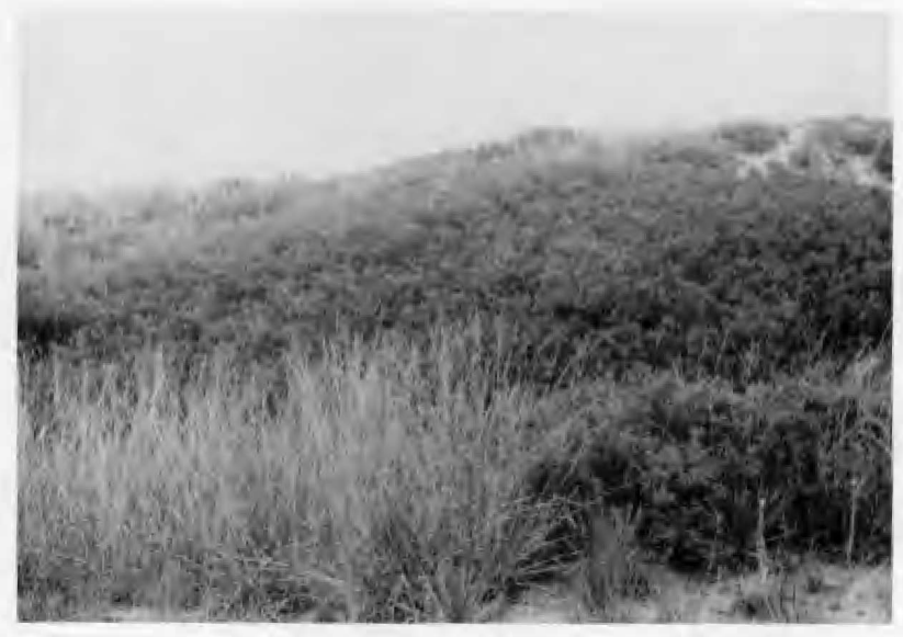
Fig. 5.-Havard shin oak-mixed grass community, western Bailey County.