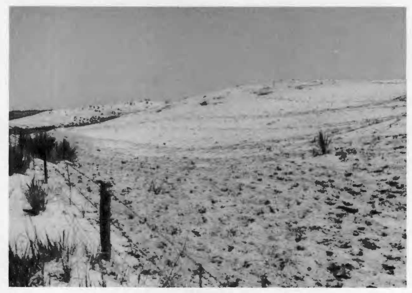
Fig. 2.-Sand dunes on Texas-New Mexico border, Bailey County.

little or no vegetation. As dunes age, they become stabilized with vegetation and a fine-grained topsoil develops (Fig. 3).