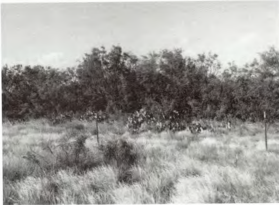
Fig. 3. Dense mesquite brushland in floodplain of the North Concho River.