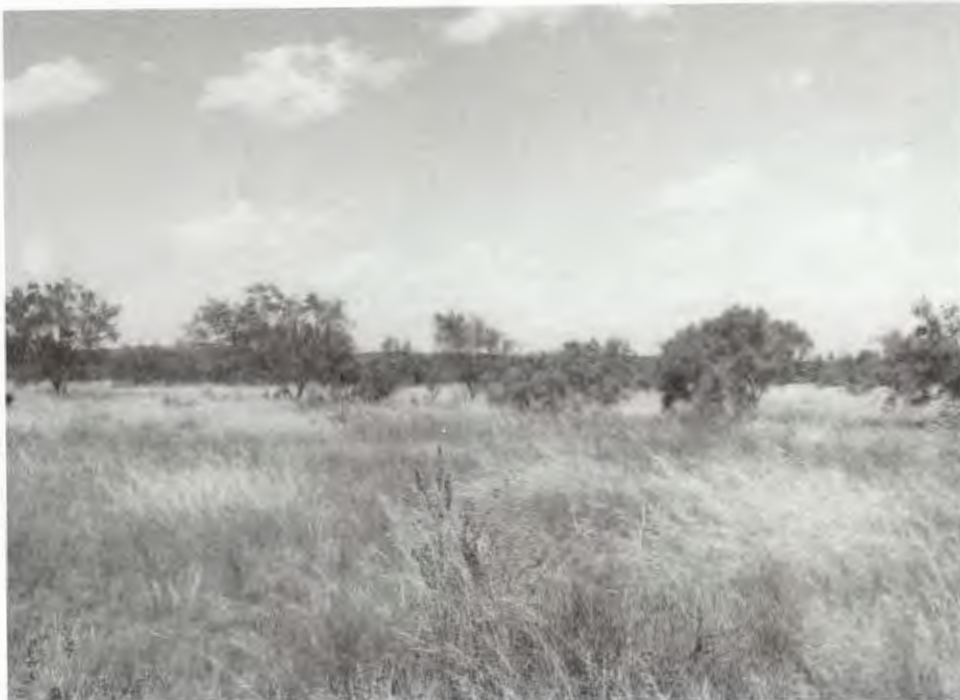
Fig. 4. Light mesquite-mixed grassland near the South Concho River. This site demonstrates secondary succession following brush control measures.