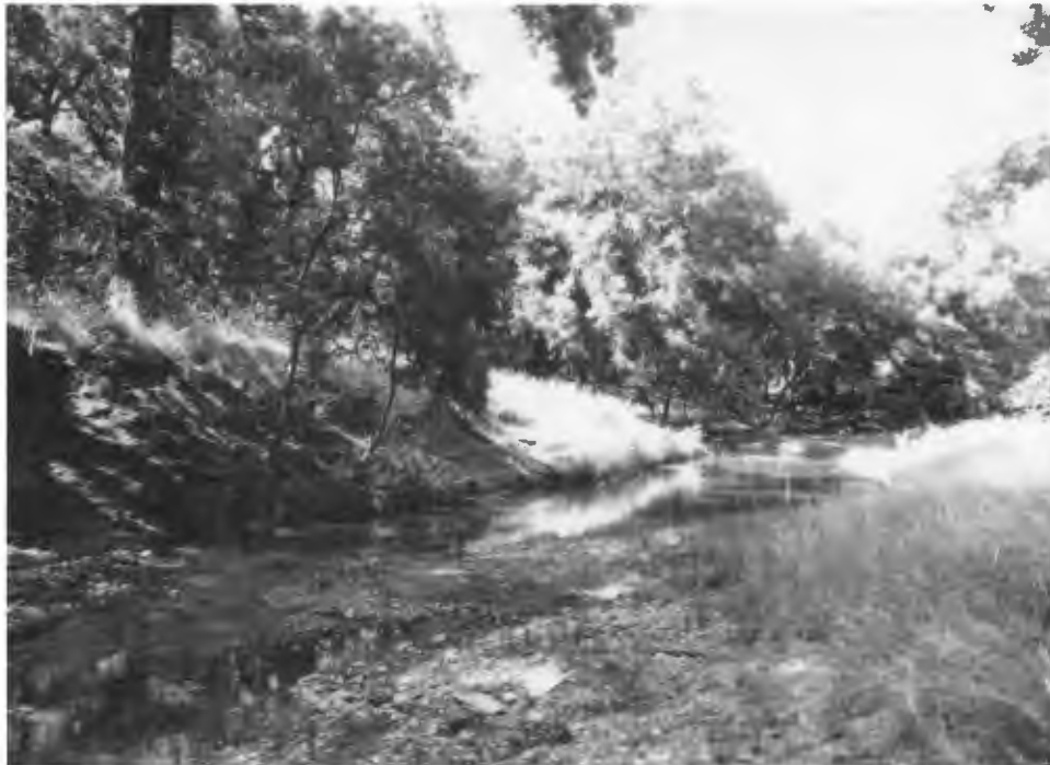
Fig. 7. Riparian forest of pecan at headwater of the South Concho River.

many specimens were deposited in the ASNHC collection of frozen tissues.