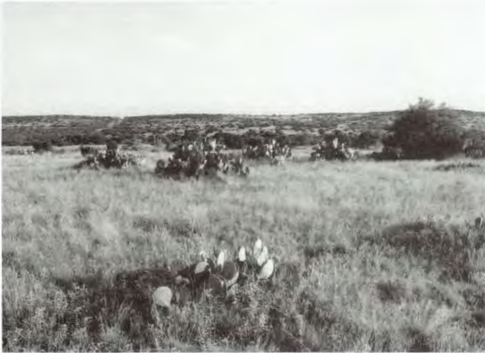
Fig. 5. Juniper-mesquite savannah near the panhandle in the northwestern quadrant of the county.