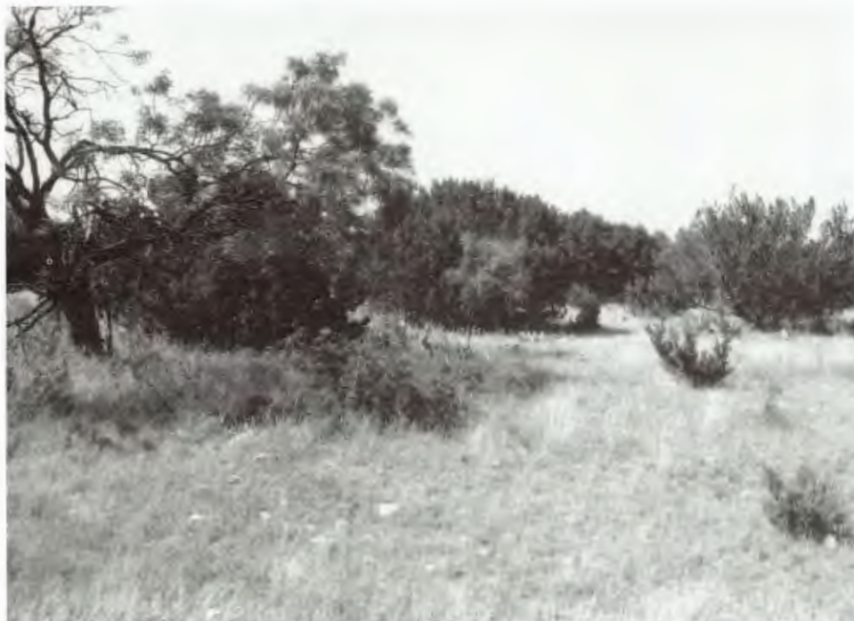
Fig. 6. Dense live oak-juniper-mesquite brushland near the southern county line.