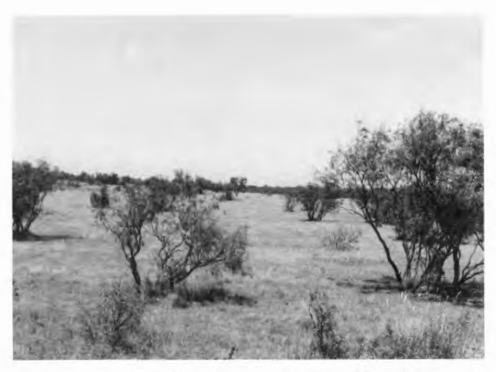
Figure 4. Mesquite grassland habitat at Lake Meredith National Recreation Area.

Additional records.— Potter Co.: Unspecified locality (Schmidly, 1991:100; Davis and Schmidly, 1994:49).