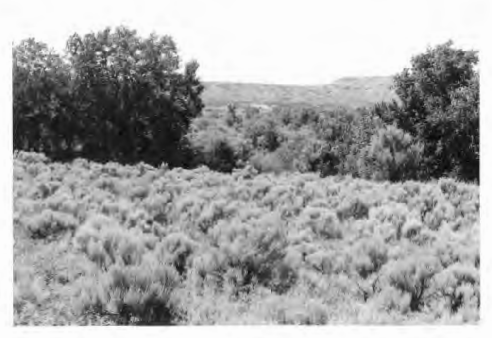
Figure 2. Typical riparian habitat along the Canadian River at Lake Meredith National Recreation Area. Dense vegetation at foreground is sand sage; mature cottonwood trees flank salt cedar and false willow in background.

1991). No specimens were taken during our survey and there are no records from Lake Meredith NRA. However, this species is known from Hutchinson County.