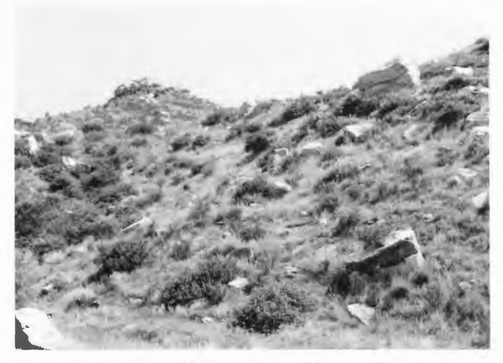
Figure 3. Typical rocky upland habitat at Lake Meredith National Recreation Area. Note common shrub and grass species amongst the boulders.

areas. The individual we took (collected on 10 July) was a male with testes that measured 10 \ge 5 .