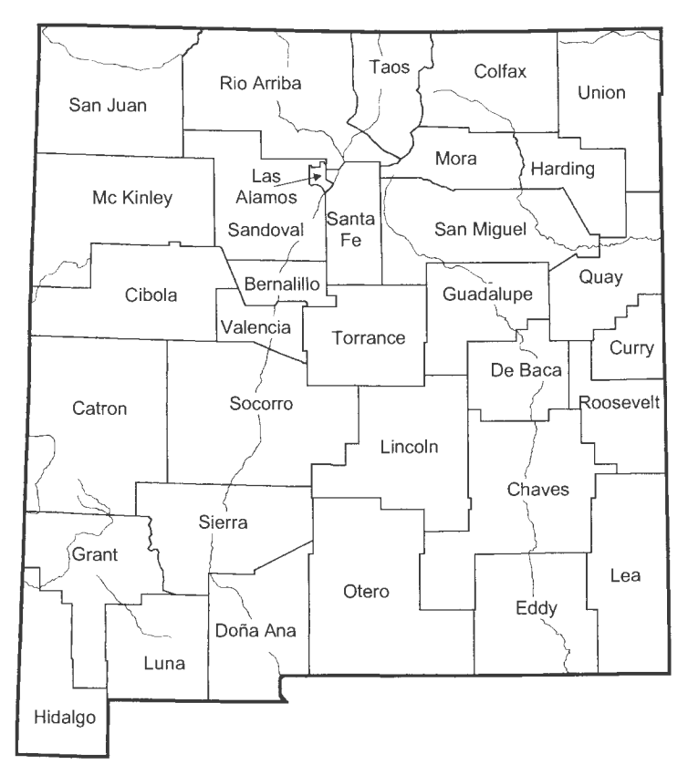
Figure 1. New Mexico county boundaries. Thin lines indicate major rivers.

Curry, Roosevelt, and Lea counties; Bermudez et al. 1995; Frey, in press). With the possible exception of animals from the northern edge of the Llano Estacado, the Arkansas River drainage, and the Animas Mountains, opossums in New Mexico likely resulted from human-mediated introductions (Bermudez et al. 1995). A report of this species from the Animas Mountains in Hidalgo Co. (Cook 1986) is of uncertain subspecific status.