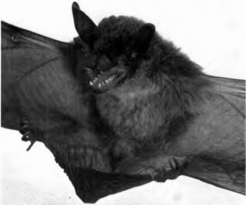
FIG. 2.—Photograph of the adult male holotype of Eptesicus guadeloupensis in life.

having hairs tipped with a dark, chocolate brown; underparts pale, hairs tipped with dark buff to almost white in some areas. Karyotype (Fig. 3) as in other members of the genus (Baker and Patton, 1967); 2N=50 , FN=48 ; all autosomes acrocentric, X-chromosome submetacentric, Y-chromosome acrocentric.