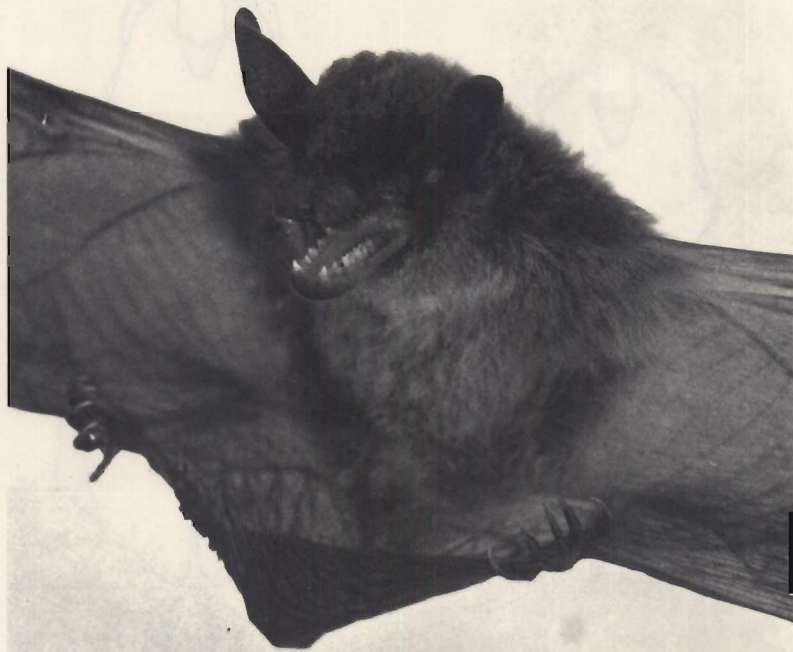
FIG. 2.—Photograph of the adult male holotype of Eptesicus guadeloupenensis in life.

having hairs tipped with a dark, chocolate brown; underparts pale, hairs tipped with dark buff to almost white in some areas. Karyotype (Fig. 3) as in other members of the genus (Baker and Patton, 1967), 2N=50 , FN=48 ; all autosomes acrocentric, X-chromosome submetacentric, Y-chromosome acrocentric.