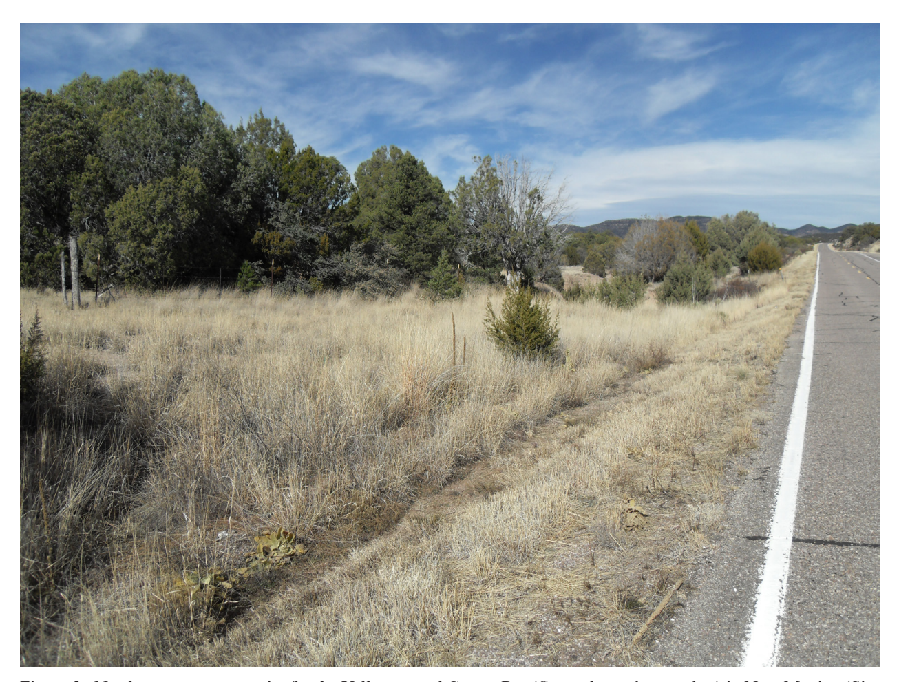
Figure 3. Northernmost capture site for the Yellow-nosed Cotton Rat (Sigmodon ochrognathus) in New Mexico (Site 10 in Catron County, N33°30.186', W108°55.659'). Numerous stones covered a fine-grained, powdery soil. Grasses included sideoats grama (Bouteloua curtipendula), blue grama (B. gracilis), hairy grama (B. hirsuta), bluestem (Andropogon), and three-awn (Aristida). Other vegetation included junipers (Juniperus), rabbitbrush (Chrysothamnus), honey mesquite (Prosopis glandulosa), catclaw (Acacia or Mimosa), cholla (Opuntia), prickly pear (Opuntia), broom snakeweed (Gutierrezia sarothrae), and common mullein (Verbascum thapsus). Beyond the fence, junipers, pinyon pines (Pinus edulis), and oaks (Quercus) were present; and the ground contained patches with large rocks. Photo taken on 9 January 2017.

length. Such habitats are similar to those occupied by S. ochrognathus in other parts of its range. For example, in New Mexico, individuals were observed on rocky hillsides with bunch grass, succulents, shrubs as well as pinyons, junipers, and oaks (Findley and Jones 1960; Findley et al. 1975). In Arizona, individuals were captured in grassy, rocky slopes near or within the oak belt with mention of blue grama, side-oats grama, three-awn, catclaw, mesquite, prickly pear, and junipers (Hoffmeister 1963). In Texas, S. ochrognathus was documented in rocky slopes with gramas, bluestem, pinyons, junipers, and oaks (Baker 1969; Baccus 1971;