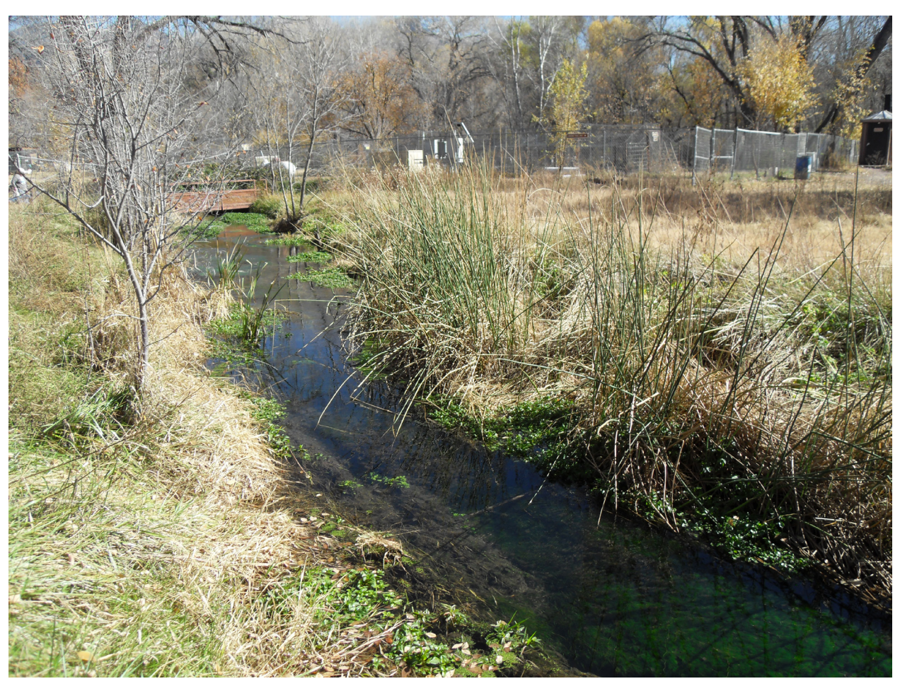
Figure 4. Habitat along a permanent, human-made stream at the Glenwood State Fish Hatchery in Catron County, New Mexico (Site 7). Plants along the bank included softstem bulrush ( Schoenoplectus tabernaemontani ), horsetails ( Equisetum ), Johnsongrass ( Sorghum halepense ), tall fescue ( Schedonorus arundinaceus ), and lovegrass ( Eragrostis ). Photo taken on 24 November 2015.

female captured on 20 October represented the latest direct evidence of reproductive activity in New Mexico. Thus, females are reproductively active (pregnant and/or lactating) in the state at least from March to October. However, the female captured on 31 March 2003 suggests occasional reproductive activity in mid to late winter. In Arizona and Texas, females are reported to be reproductively active throughout the year (Hoffmeister 1963; Baccus 1971).