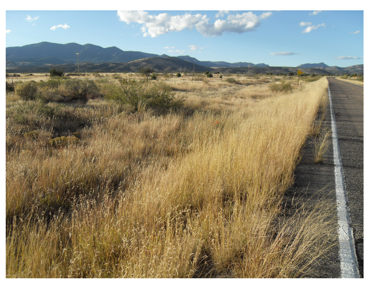
Figure 2. Grassy right-of-way along US Highway 180 in Catron County, New Mexico. At this location (Site 9), sideoats grama ( Bouteloua curtipendula ) and blue grama ( B. gracilis ) were the dominant grasses, silver bluestem ( Bothriochloa laguroides ) and green sprangletop ( Leptochloa dubia ) also were present, and honey mesquites ( Prosopis glandulosa ) were present but widely dispersed. Photo taken on 2 November 2016.

At Site 9 on 1 November 2016, three separate samples of vegetative cuttings were collected along surface runways used by S. ochrognathus (Fig. 2). The number of cut sections was determined for each sample, and the length of each section was measured.