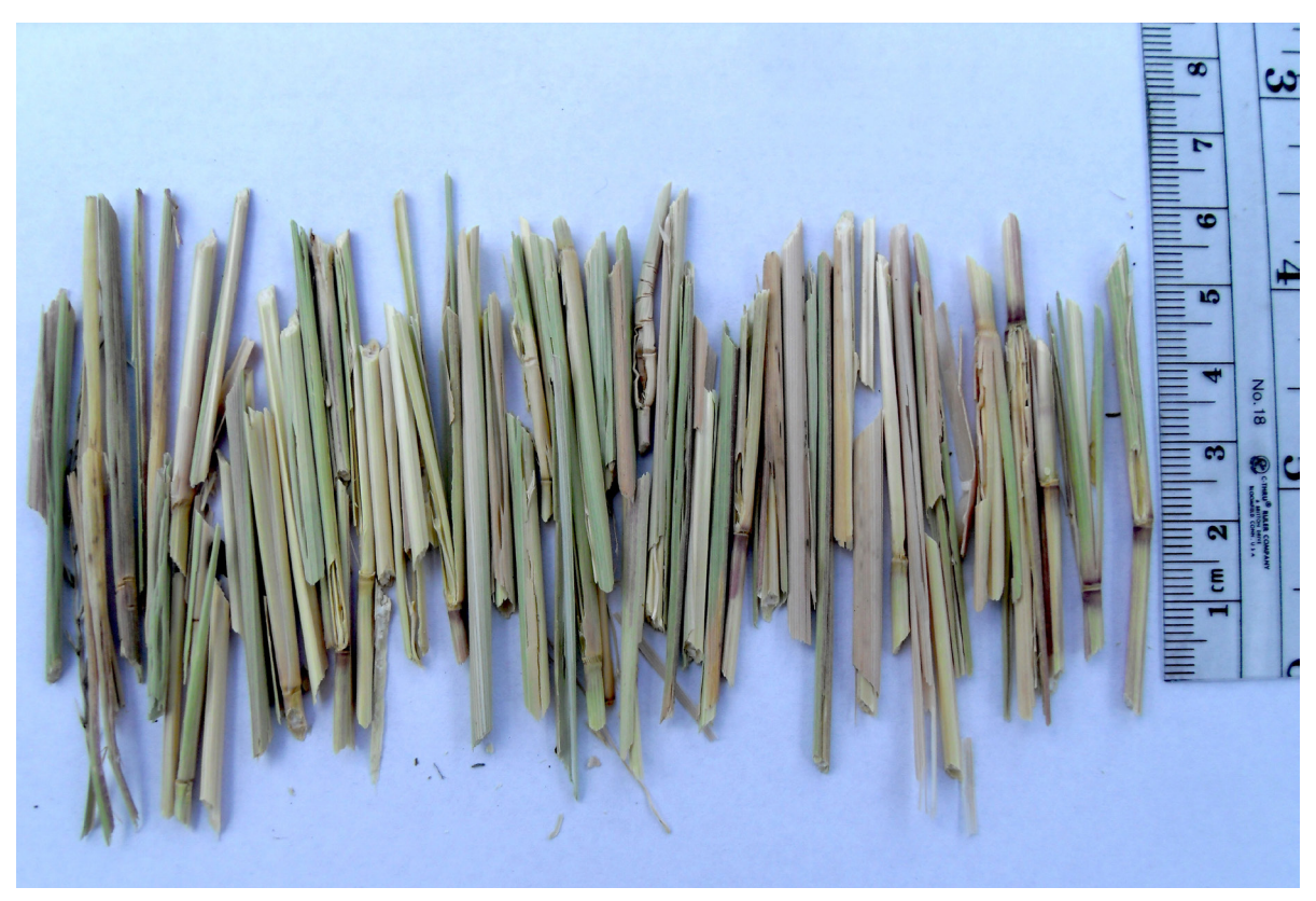
Figure 5. Sample of cut grass stems collected along a surface runway where a Yellow-nosed Cotton Rat ( Sigmodon ochrognathus ) was captured along US Highway 180 in Catron County, New Mexico. Originally, stems in the photograph were part of a pile of stems that contained 64 cut sections.

S. ochrognathus was captured with the Hispid Cotton Rat (Sigmodon hispidus) at Site A (Geluso 2009a, 2009b). Yellow-nosed Cotton Rats also have been reported to be sympatric with S. fulviventer in Durango and Chihuahua, Mexico (Baker 1969; Anderson 1972) and with S. hispidus in Arizona (Hoffmeister 1963).