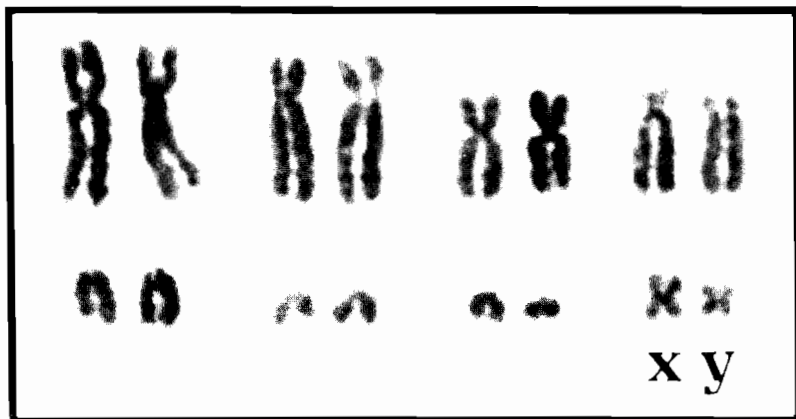
FIG. 1.—Karyotype of a male Musonycteris harrisoni from Jalisco, México.

Hylonycteris (ITU 36152, adult male from 3 km. E Teapa, Grutas de Cocona, Tabasco) is approximately half the size of the X but has extremely reduced arms above the centromere.