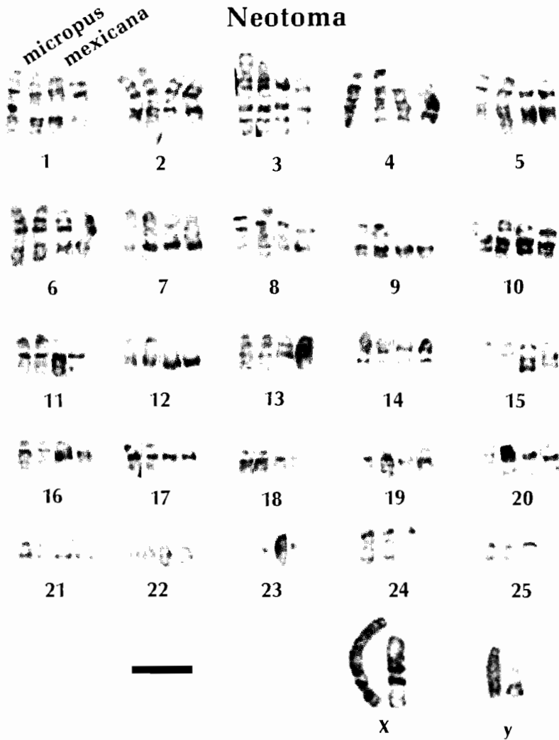
FIG. 1.—A comparison of diploid G-banded chromosomes of Neotoma micropus and N. mexicana . Chromosomes are numbered according to the standard chromosomal numbering system for Peromyscus (Committee for standardization of chromosomes of Peromyscus , 1977).

that euchromatin distal to the centromere in the long arm appears to be missing in N. mexicana . In chromosome 23 the biarm condition in N. micropus seems to be rearranged to the acrocentric condition in N. mexicana ; however, because of the presence of so few bands in 23, we are unsure of proposed homology. Because the standard