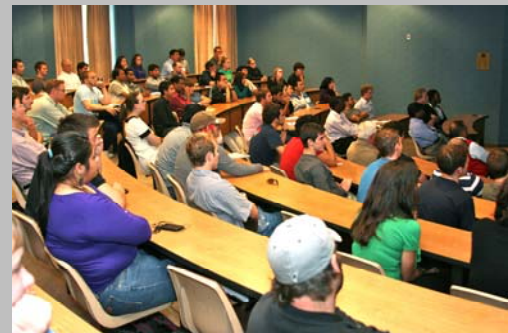
The room was packed! What a success- thanks for coming.