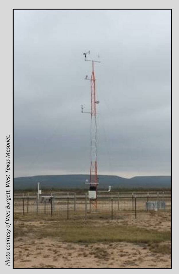
(Above) - The West Texas Mesonet McCamey station #101 in southwestern Upton County.

NWI is proud to announce that the burgeoning West Texas Mesonet network is now working on adding its 103rd station in the region. Number 101 opened near McCamey in Upton County, Texas, and Number 102 recently opened in Stamford.