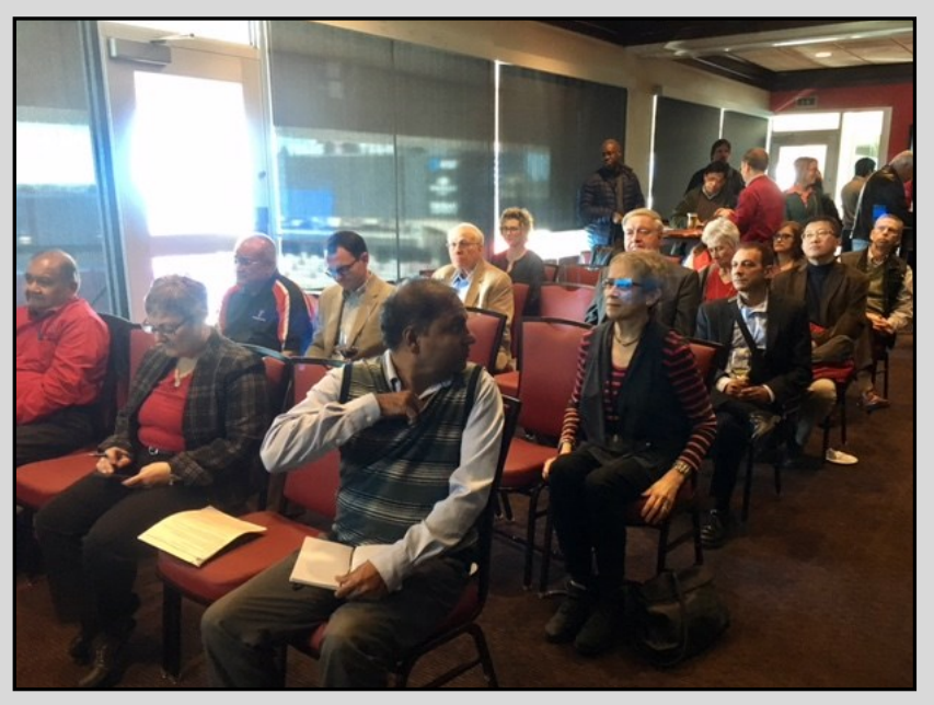
(Above) - Some of the audience who attended January's meeting of the Faculty Research Club.

According to the website, the Faculty Research Club is intended to provide a social setting to stimulate interdisciplinary research collaborations, promote informal discussions about research,