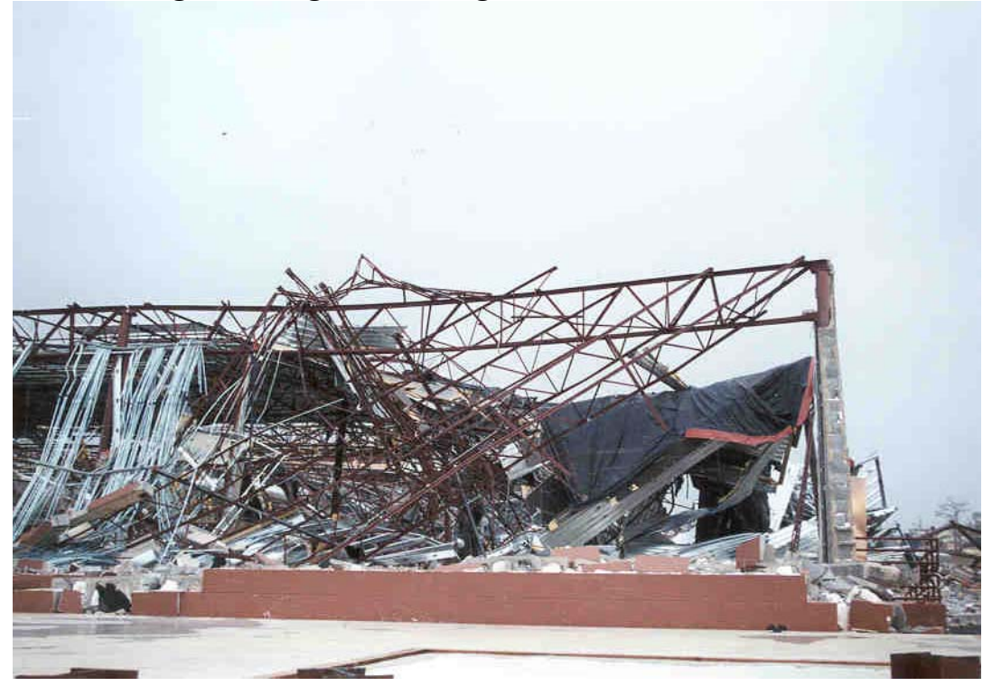
Figure 5. Englewood Village Market Place, windward wall