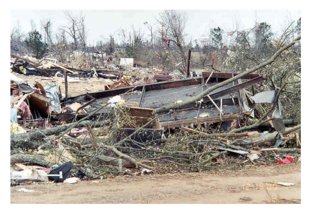
Figure 14. Destroyed Manufactured Housing, Bear Creek

that of the Hinton Place and Hillcrest Meadows subdivisions; however, ten of the twelve storm-related deaths occurred in the Bear Creek Park. Given this similar intensity of wind speed, it can only be assumed that the large loss of life is attributed to the difference in construction types and quality of construction.