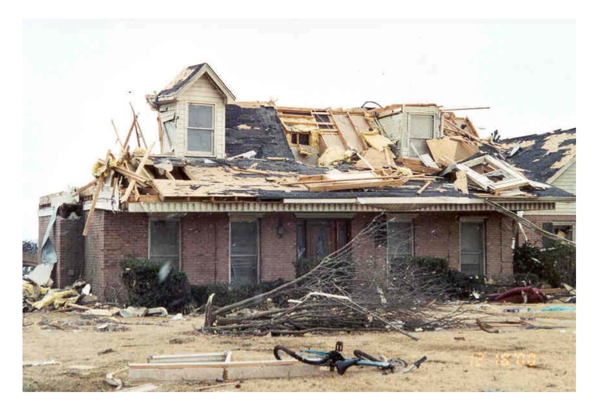
Figure 7. Hinton Place Residence, near vortex

Hillcrest Meadows was adjacent to and downwind from Hinton Place. Figure 8 portrays a line of homes on the windward side of the subdivision. The home in the foreground was totally destroyed and was presumably under the vortex of the tornado. This photo also indicates the progression of damage (from most to least). Roof damage was predominate in both subdivisions, with wall and other major damage only occurring under or near the narrow vortex.