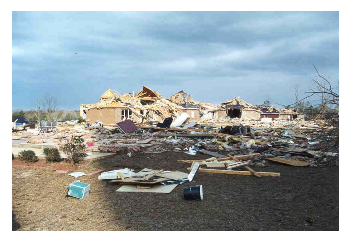
Figure 8. Hillcrest Meadows Residence, showing gradation of damage from center of tornado

As previously mentioned, considering construction standards and the reserve strength factors, the residence in Figure 8 could have been destroyed by winds in a range for an F2 tornado. The level of damage to the adjacent homes further supports this theory and demonstrates the range of wind speeds away from the vortex.