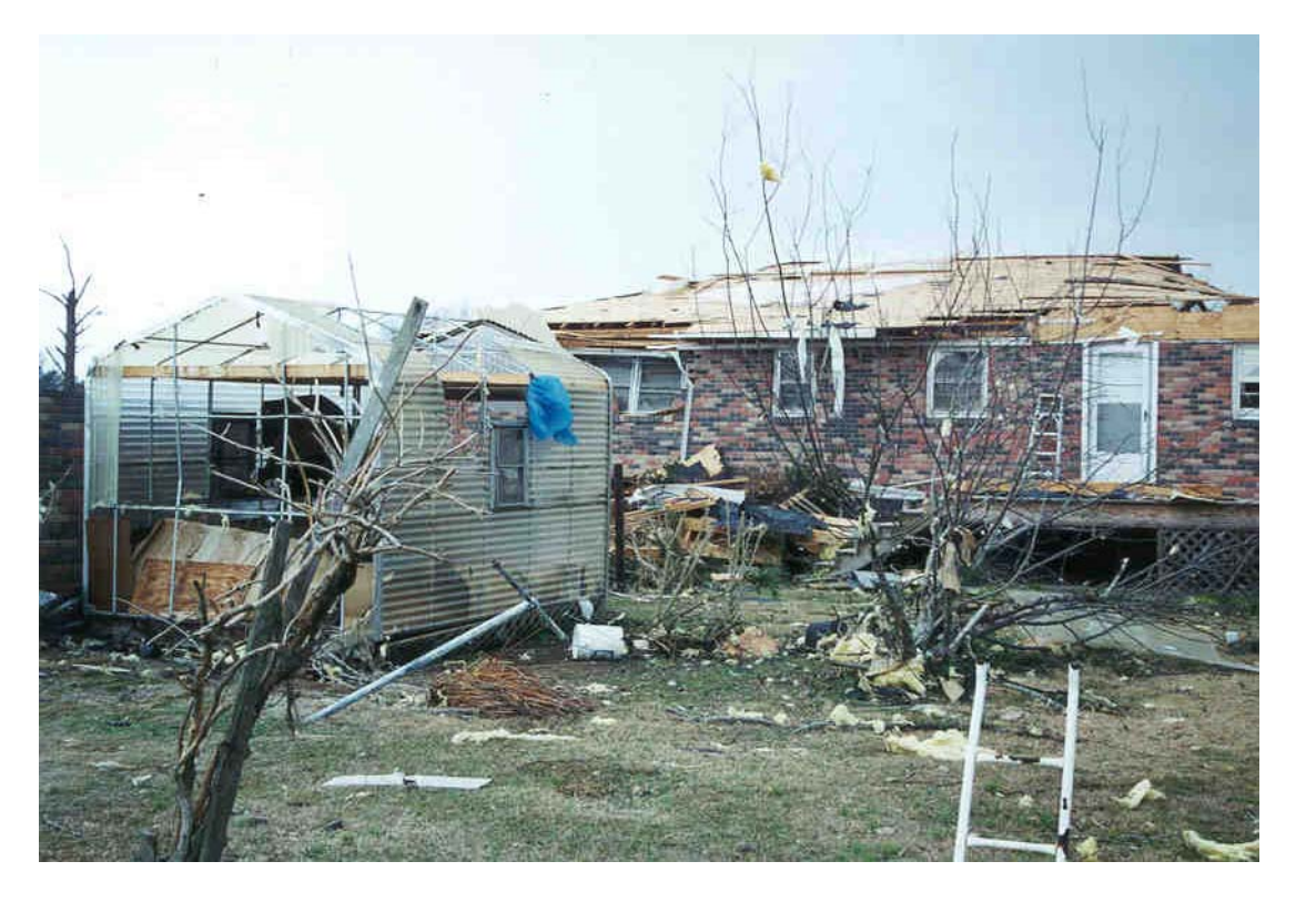
Figure 3. Englewood Meadows Home

From Englewood Meadows the tornado proceeded in a northeasterly direction crossing open ground until it struck the nearly complete and not yet occupied Englewood Village Market Place which contained the Winn Dixie Supermarket. The shopping village was constructed of built-up roofing on metal decking attached to steel bar joists bearing on joist-girders, columns and unreinforced masonry (URM) walls. The joist and girder spans were long, and the URM walls were tall (see Figures 4 and 5).