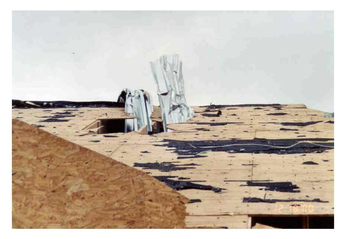
Figure 9. Sheet Metal Missile, Hinton Place