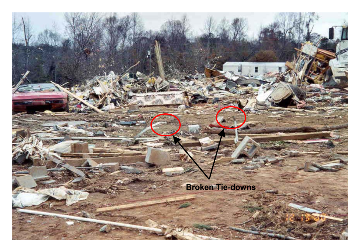
Figure 13. Bear Creek Mobile Home Site with broken tie-downs