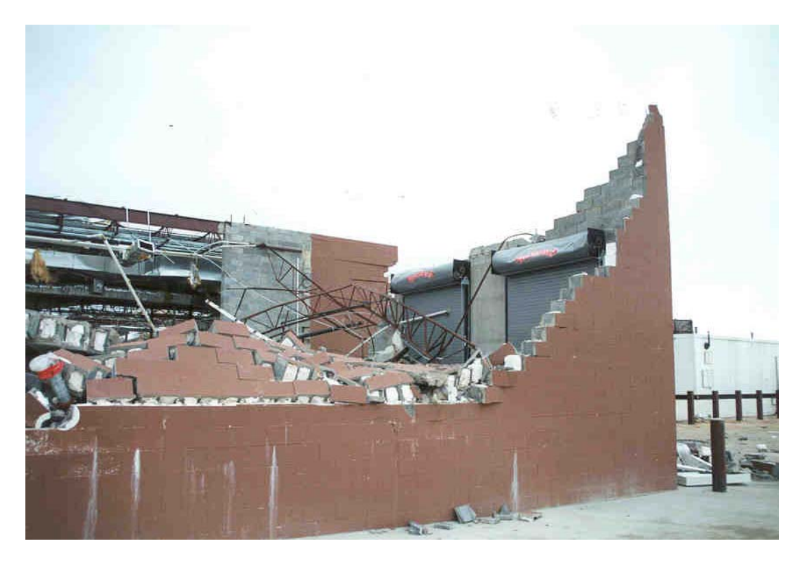
Figure 6. Englewood Village Market Place, internal pressurization

The shopping center building was under construction and was nearly complete; however, the window wall systems had not been installed. Therefore, for wind analysis purposes, the building would be considered as a partially enclosed structure. The wind forces acting upon the structure would have included both external and internal pressures. The combination of these forces tore the decking from the joists, thereby snarling the light steel structural elements and pulling down the URM walls. Further evidence of the internal pressurization is shown in Figure 6. The rolling doors, which would have experienced windward external forces, remained in place due to the negating internal pressures, while the roof deck experienced the combination of internal and external