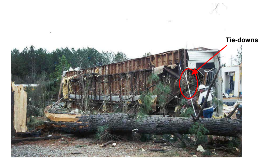
Figure 2. Englewood Meadows Mobile Home

The mobile home in Figure 2 represents the classic definition of the F1 description – "trailer houses pushed or overturned" (Fujita, 1971). The trailer had tie-downs and was underpinned. Photographs of the adjacent homes, Figure 3, present damage consistent with the F1 description, "roof surfaces peeled off and windows broken" (Fujita, 1971). However, the assigned wind speeds for an F1 tornado by Fujita would approach the reserve strength of the site built homes and presumably can devastate the mobile home. The assumption drawn was that either the homes were constructed better than the standard or that the wind speed better fit the category of F0 winds.