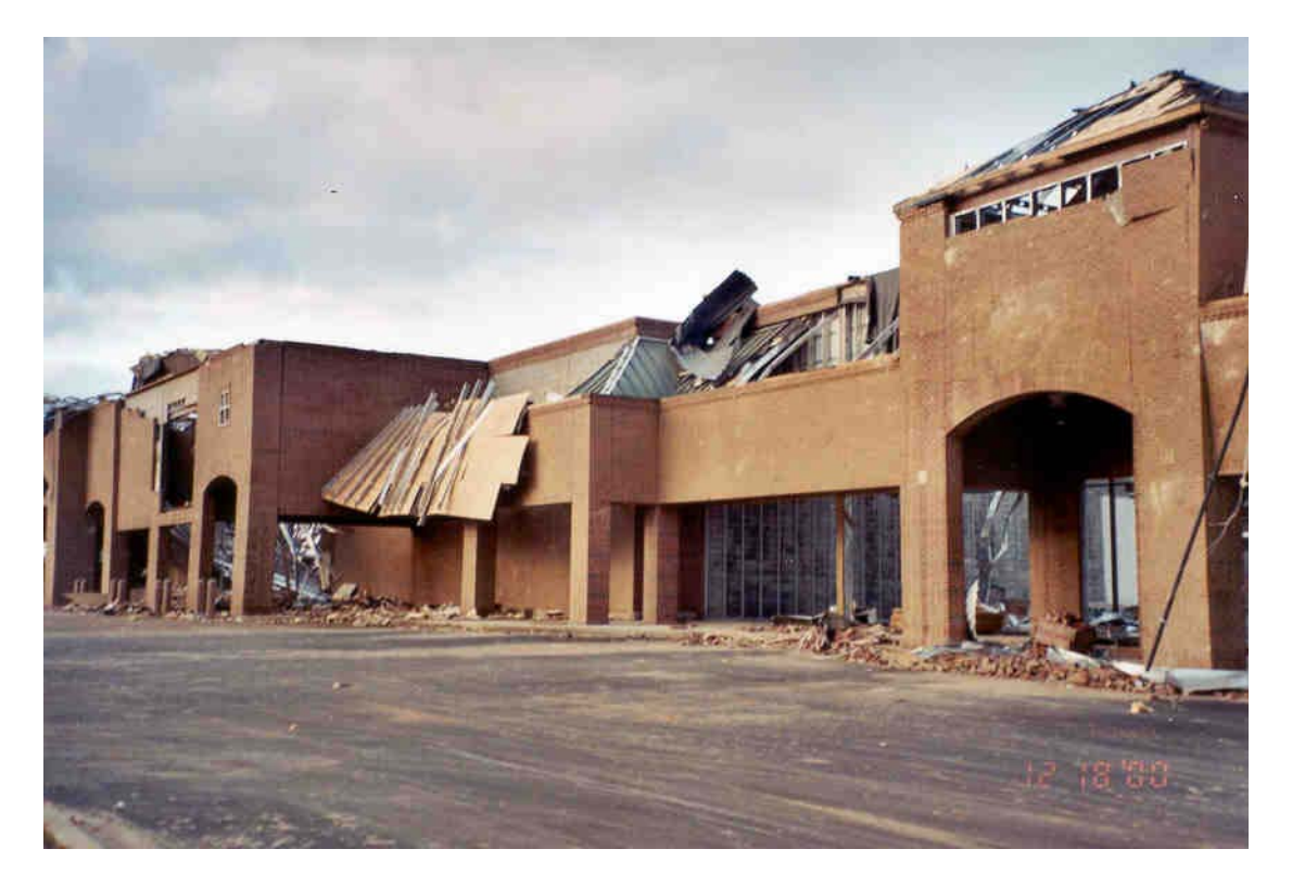
Figure 4. Englewood Village Market Place, leeward wall