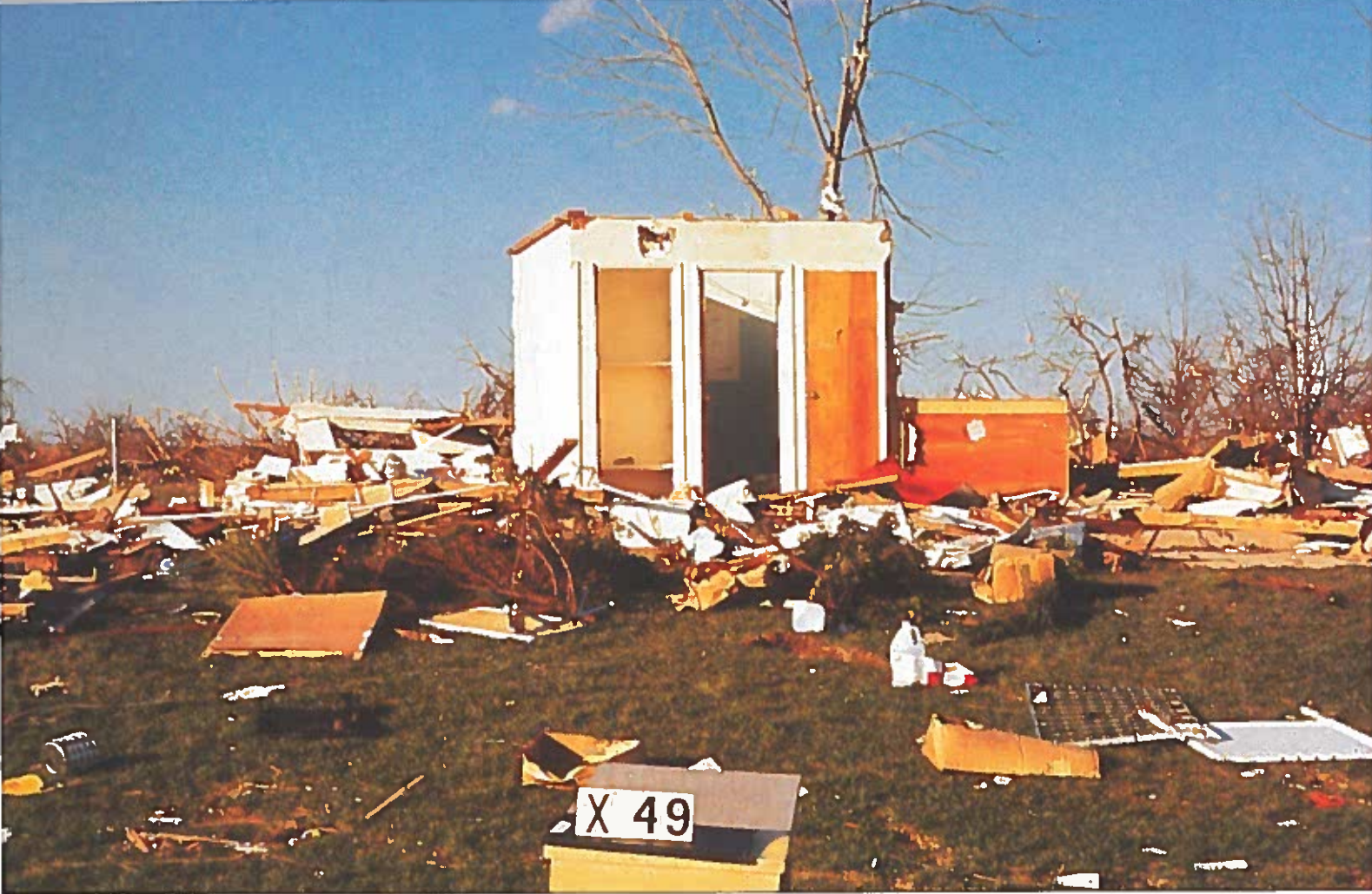
ABOVE: A STORM SHELTER THAT SURVIVED THE OKLAHOMA CITY TORNADO IN 1999.

“Our research continues to find ways to economically provide protection from extreme winds and to reduce the damage they cause.”