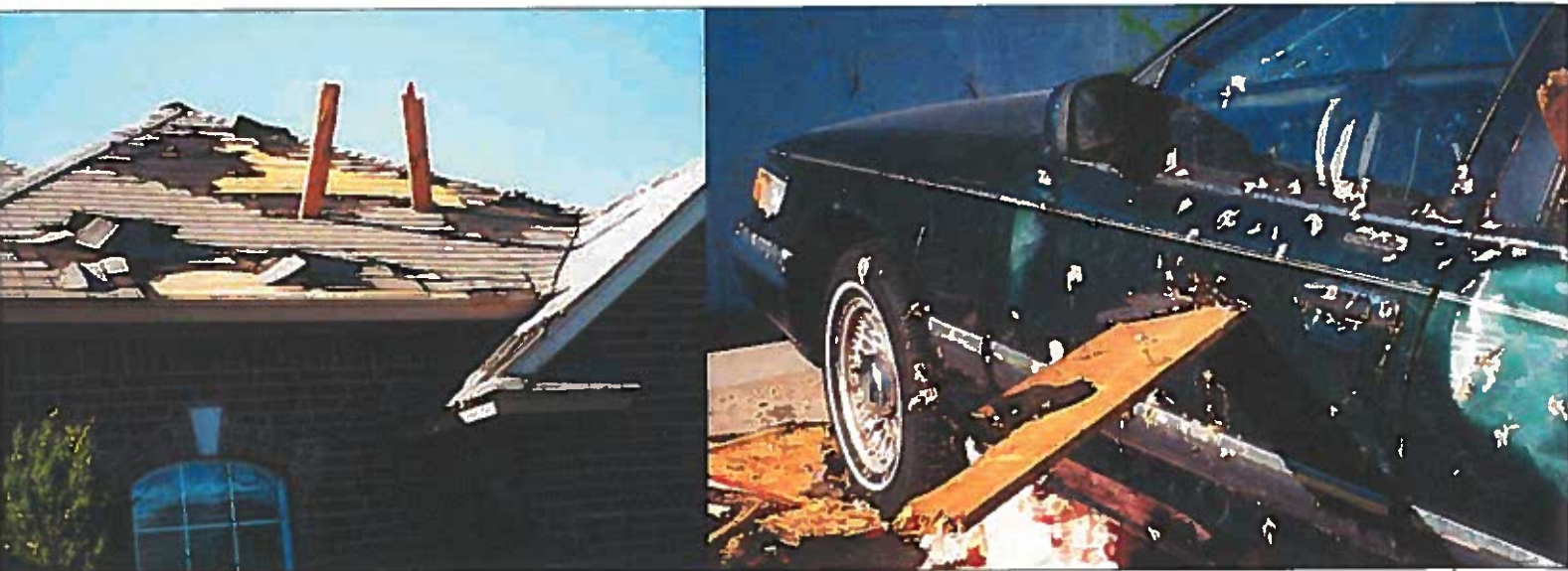
TORNADO PHOTO ON OPENING SPREAD COURTESY: TEXAS NOAA PHOTO LIBRARY, NOAA CENTRAL LIBRARY; OAR/ERL/NATIONAL SEVERE STORMS LABORATORY