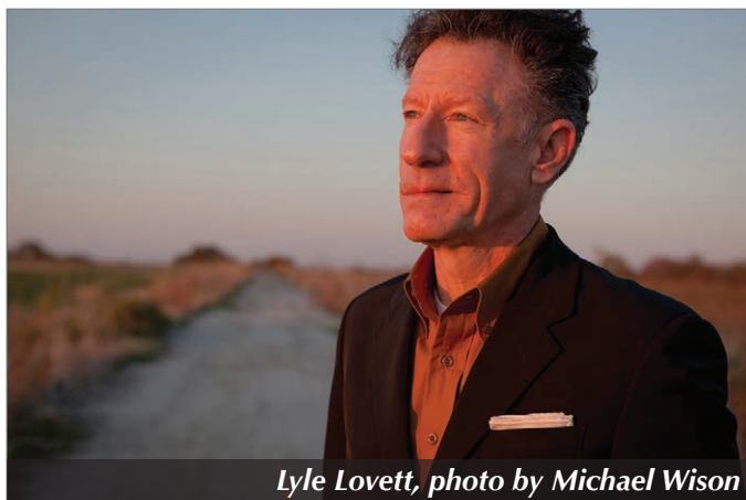
Lyle Lovett

Location: Texas Tech University Allen Theatre