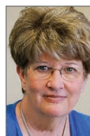
Texas Tech University