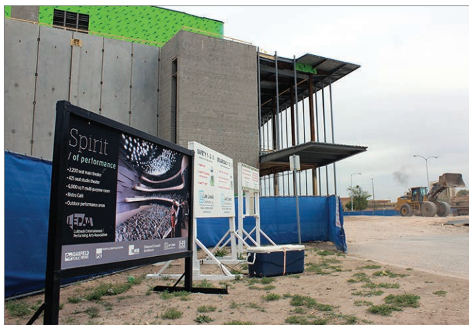
Buddy Holly Hall of Performing Arts and Sciences construction site.

Location: Abilene Regional Airport 2933 Airport Blvd., Ste 200, Abilene