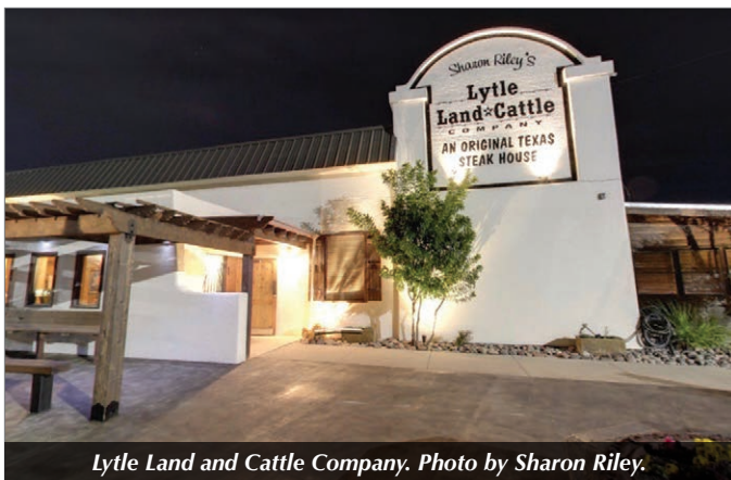
Lytle Land and Cattle Company.