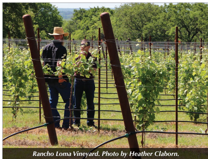
Rancho Loma Vineyard.

Location: Huffington Pilates and Fitness Studio 9 Hospital Drive, Abilene