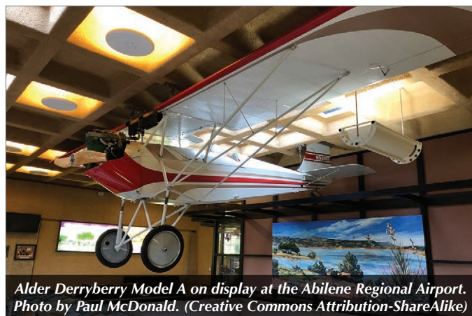
Alder Derryberry Model A on display at the Abilene Regional Airport. Photo by Paul McDonald. (Creative Commons Attribution-ShareAlike)

Location: Abilene TTUHSC 1650 Pine Street, Abilene