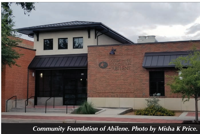
Community Foundation of Abilene.