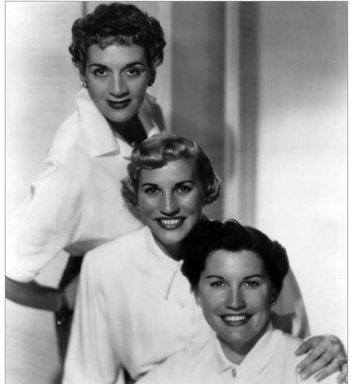
The Andrews Sisters. From top: LaVerne, Patty, Maxene.

Location: Abilene TTUHSC 1650 Pine Street, Abilene