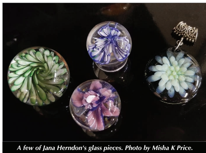
A few of Jana Herndon's glass pieces.

Location: Studio 13 909 N. 13th Street, Abilene