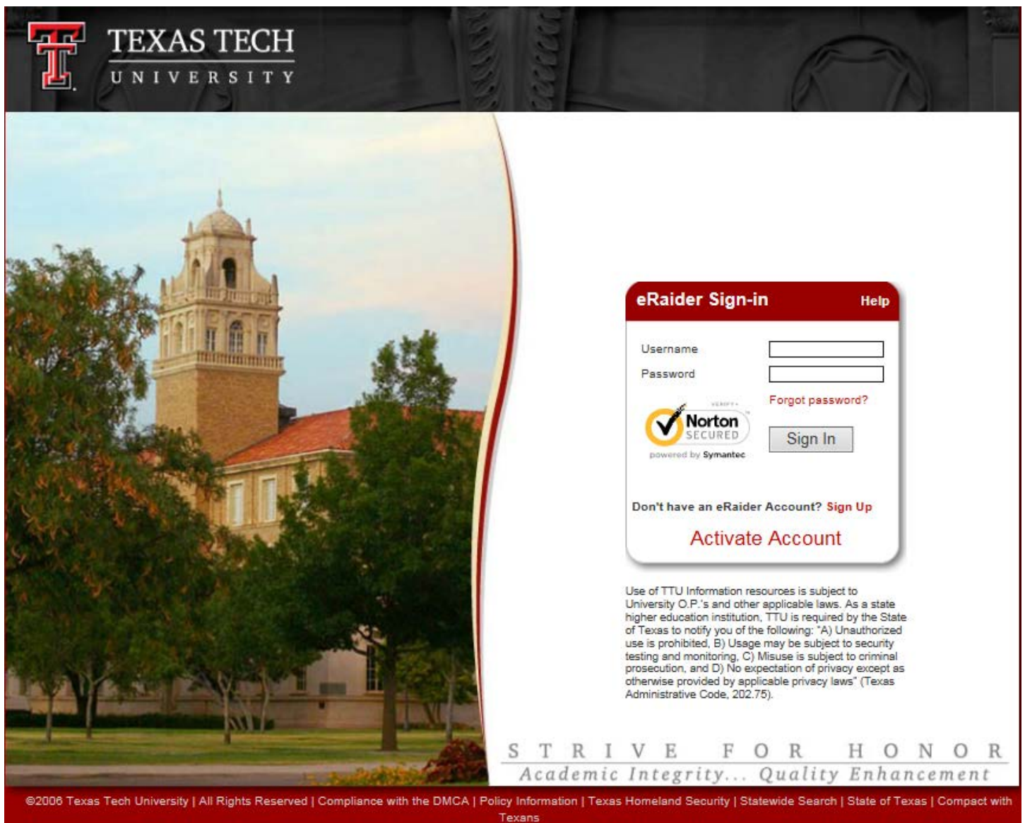
Figure 1 – Login Screen

After navigating to the web page detailed on page three, you will be prompted with a screen similar to Figure 1. Use your eRaider username and password to log into the system.