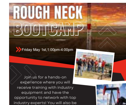
14 Upcoming Events