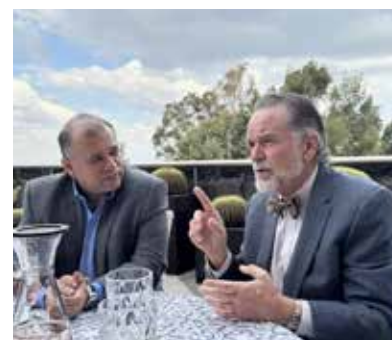
04 Faculty Spotlight