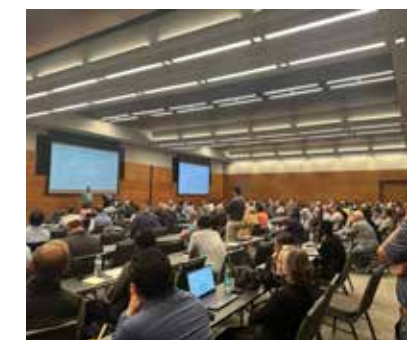
07 The Southwestern Petroleum Short Course