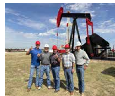
13 Industry Involvement