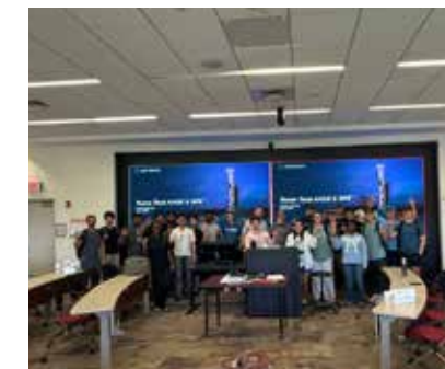
10 Student Spotlight