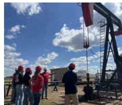
08 Landman for a Day & Roughneck Bootcamp