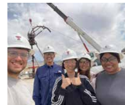
05 Department Research