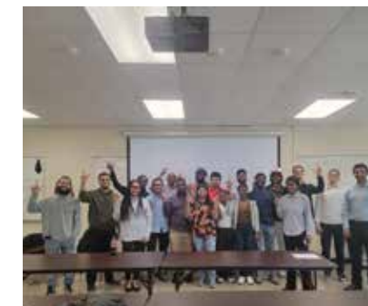
9 Inaugural Hackathon