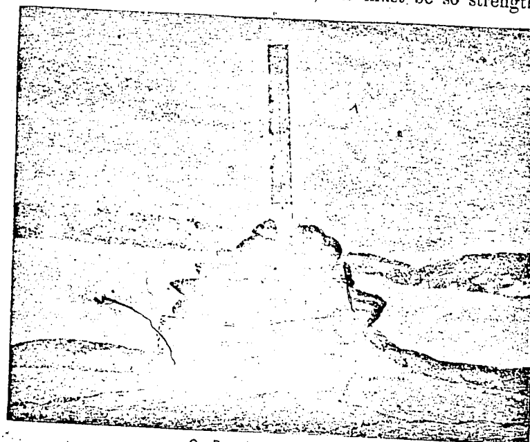
Our Records and Instruments. [Cached October, 1883, on Stalknecht Island.]