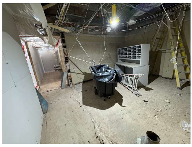
Copy room demolitions nearing completion