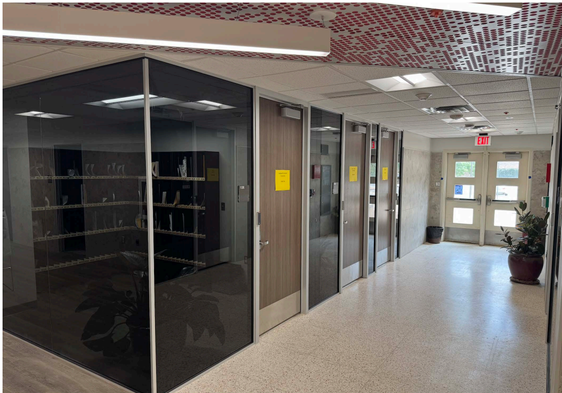
Left: Updated Function Rooms