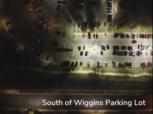
South of Wiggins Parking Lot

Operations Division had a nighttime drone survey performed the first week of February. The survey captured our recent Chitwood - Weymouth projects and confirmed improvements to the lighting.