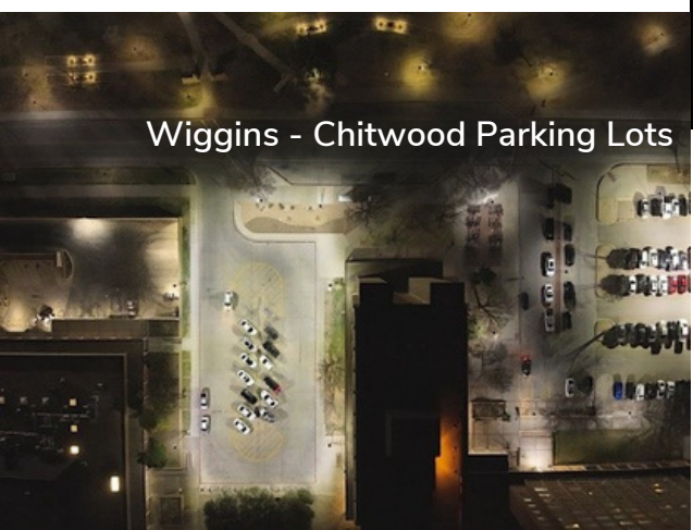
Wiggins - Chitwood Parking Lots