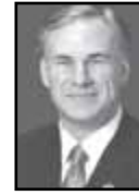
GREG ABBOTT Attorney General of Texas

Crime Victims' Compensation is a financial assistance program that helps eligible victims of crime with certain expenses related to the crime. Money for this program comes from court costs paid by criminals and deposited by each Texas county into the Crime Victims' Compensation Fund.