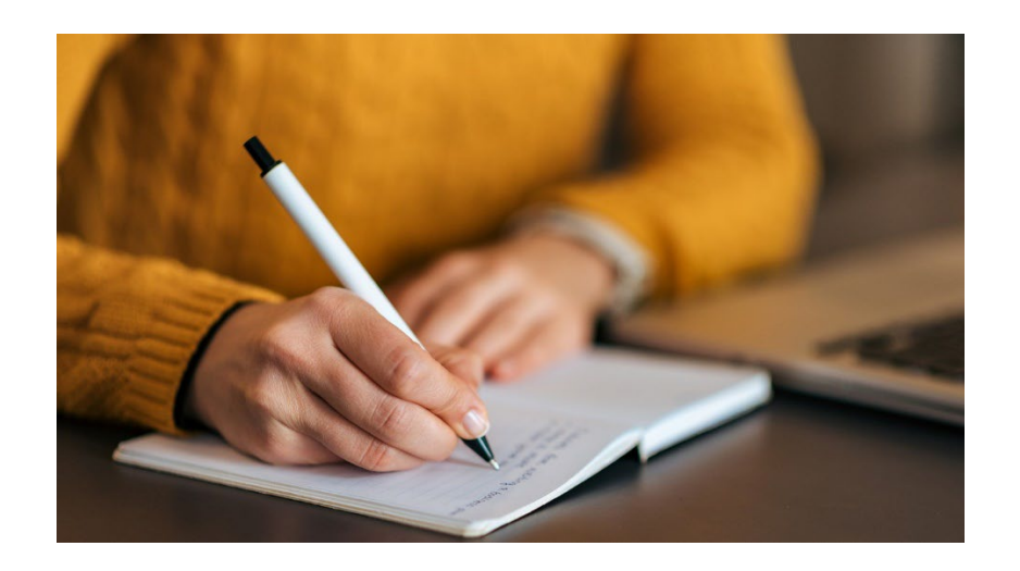
Staff Writing Group

The Texas Tech Staff Writing group is an online space where we can come together for an hour of focused, distraction-free writing.