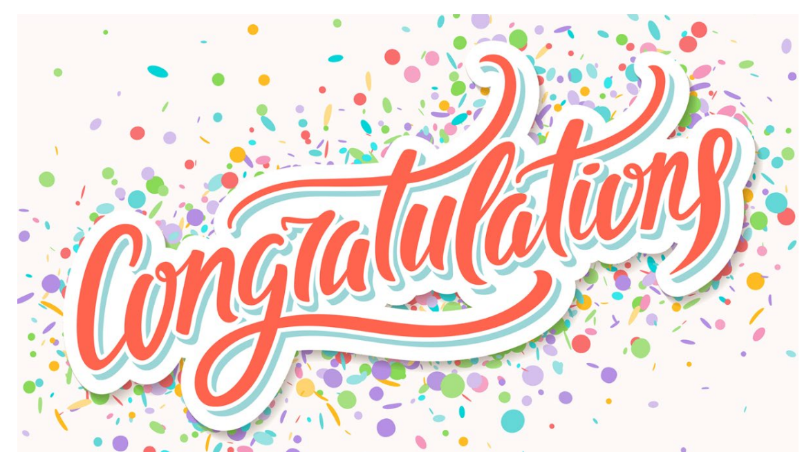
Congratulations to all our newly elected senators!