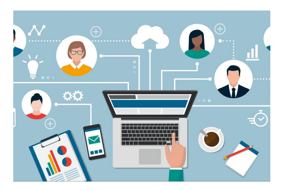
Leading Remote Teams

OP 70.49 approved the University access to remote work.