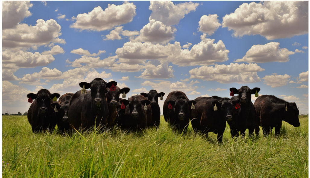
Cattle grazing on OMB.

This bulletin looks at integrating legumes with grasses to improve the profitability of forage-livestock systems while minimizing irrigation usage to preserve water.