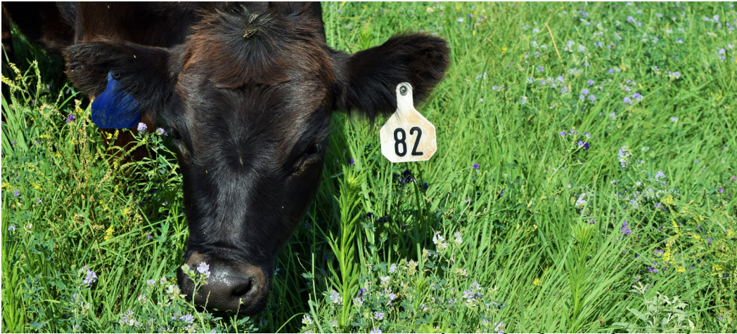
Cattle grazing on a legume/grass mix.

targets if grazing-season rainfall is less than average or above average but unevenly distributed across the season. By comparison, the amount of irrigation applied annually to cotton averages around 12 inches and for corn, around 18 inches.