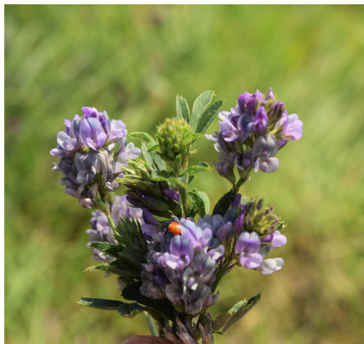
Alfalfa in bloom.

The three-year grazing trial (2014-2016) was the basis for graduate student research on water use efficiency of cattle production and legume composition and forage availability. As the Ogallala Aquifer decline further limits irrigation, the goal is to identify water-efficient forage systems while keeping