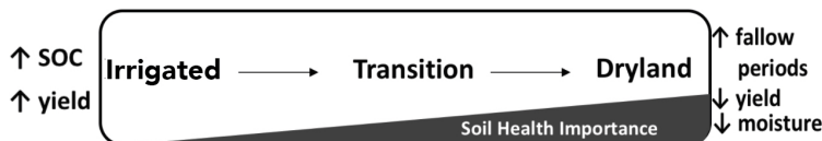
Figure 2. Transitions to dryland production require careful management to maintain soil organic carbon and overall soil health (Cano et al, 2018).