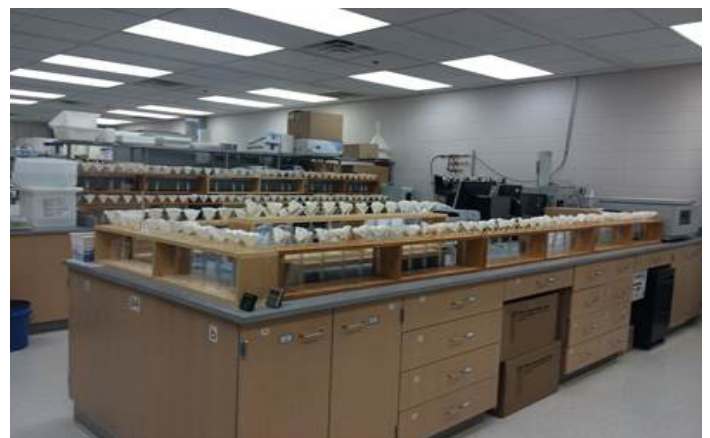
USDA-ARS soil microbiology laboratory in Lubbock, TX Supervised by Verónica Acosta-Martínez

In limited irrigation and dryland systems, agricultural conservation practices that keep the soil covered and fed with plant residues are expected to improve SOM and the soil microbiome’s adaptation to climate variability, which may include prolonged drought, and to increase water use efficiency and crop yield (Cano et al, 2017).