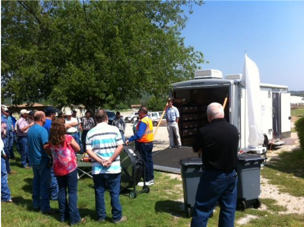
Figure 1: TxDOT Wildland Fire Emergency Response Trailer Demonstrated at the Maintenance Workshop

At each workshop, a course evaluation was distributed to the attendees. The first section of the evaluation are standard questions that TxDOT uses for all course evaluations, but the second category of questions were developed by TechMRT to assess the efficacy of the primary learning objectives of the workshop. Space was also provided for additional comments on how to improve the workshop and/or materials. This final report summarizes the proceedings of each workshop, including the evaluation scores and comments. Any significant changes made to the course materials after a workshop are also noted. The course evaluation sheets are provided in the appendix.