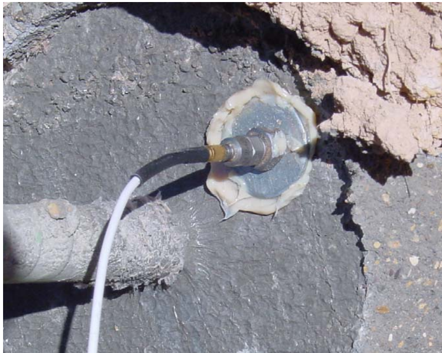
Figure 3 Accelerometer Attached to Washer on the Grout