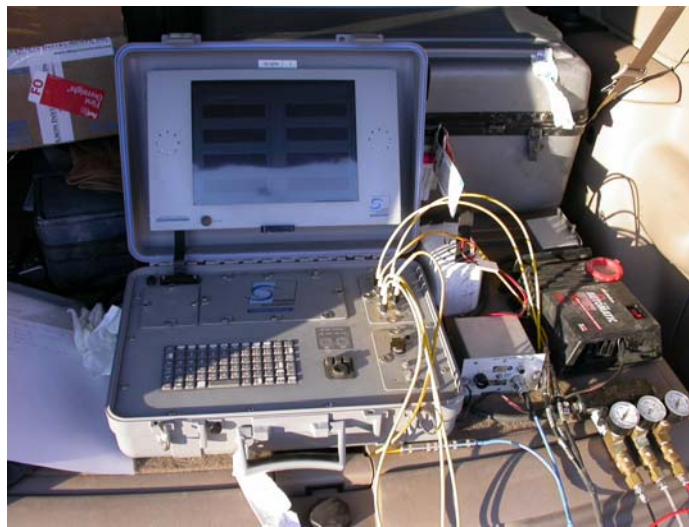
Figure 1 Freedom Data PC Used Sonic Echo Testing