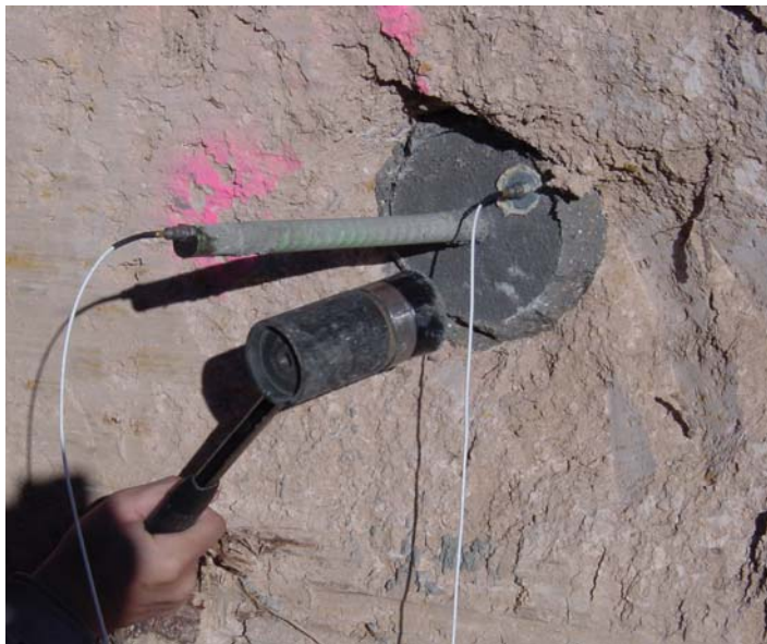
Figure 4 Hitting the Grout Column Head with 0.2-lb Hammer