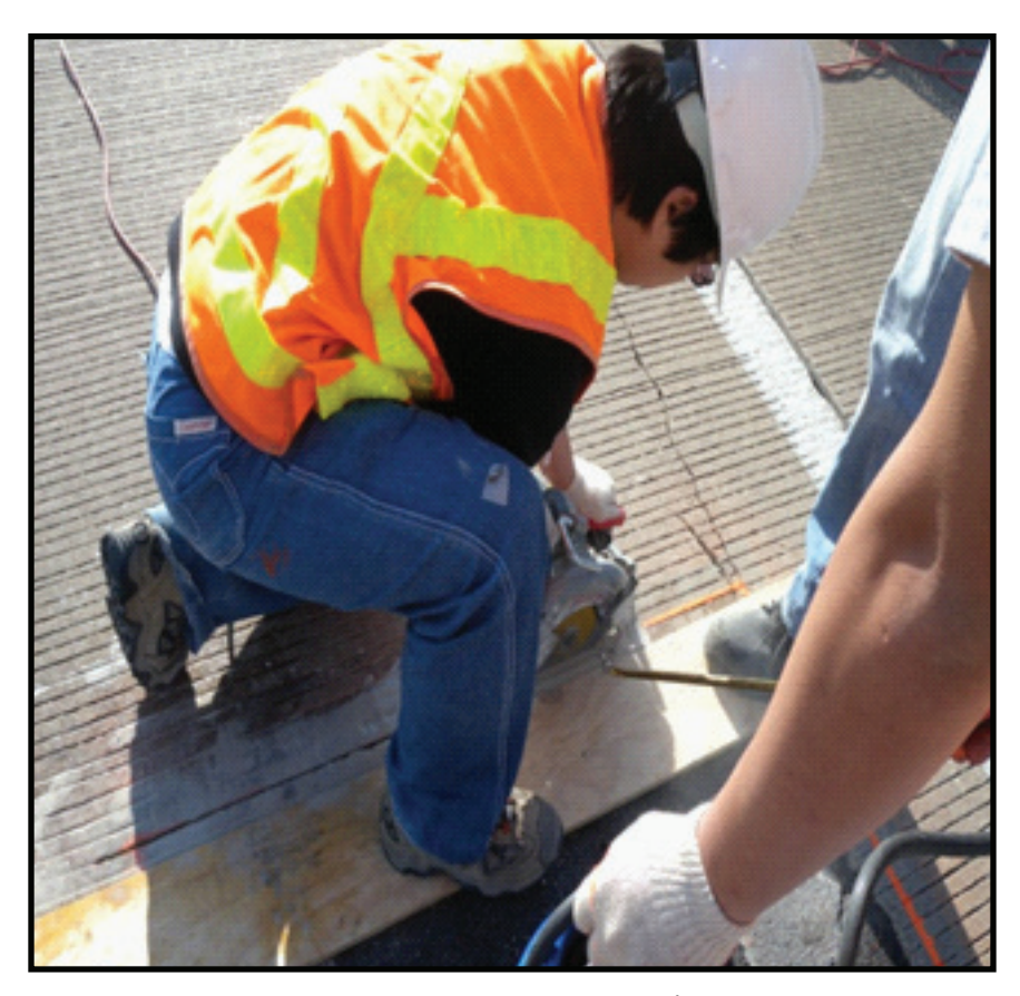
Figure 8. Saw cut operation