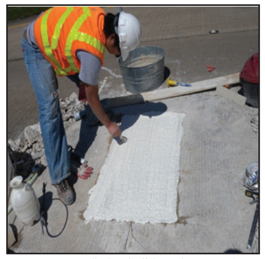
Figure 12. Application of sufficient curing compound

The surface area of PDR is relatively small, and the usual requirements for surface finish in normal concrete pavement are not applicable. The use of 2-by-4 is appropriate for screeding and finishing. Start at the center of the repair and move toward the boundaries of the repair to enhance the bonding between repair materials and the repair surface of the existing concrete.