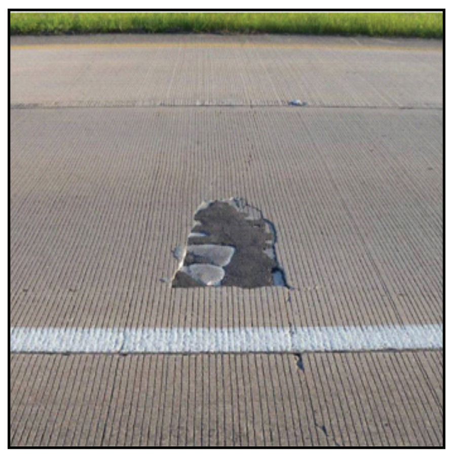
Figure 4. Partial depth distress under wheel path

Figure 3 shows that the distress occurred under the wheel path and the surface of the concrete has been fractured into smaller pieces. Note that there is no faulting at the longitudinal construction joint. Figure 4 shows similar traits, with fractured pieces and no faulting at the longitudinal warping joint.