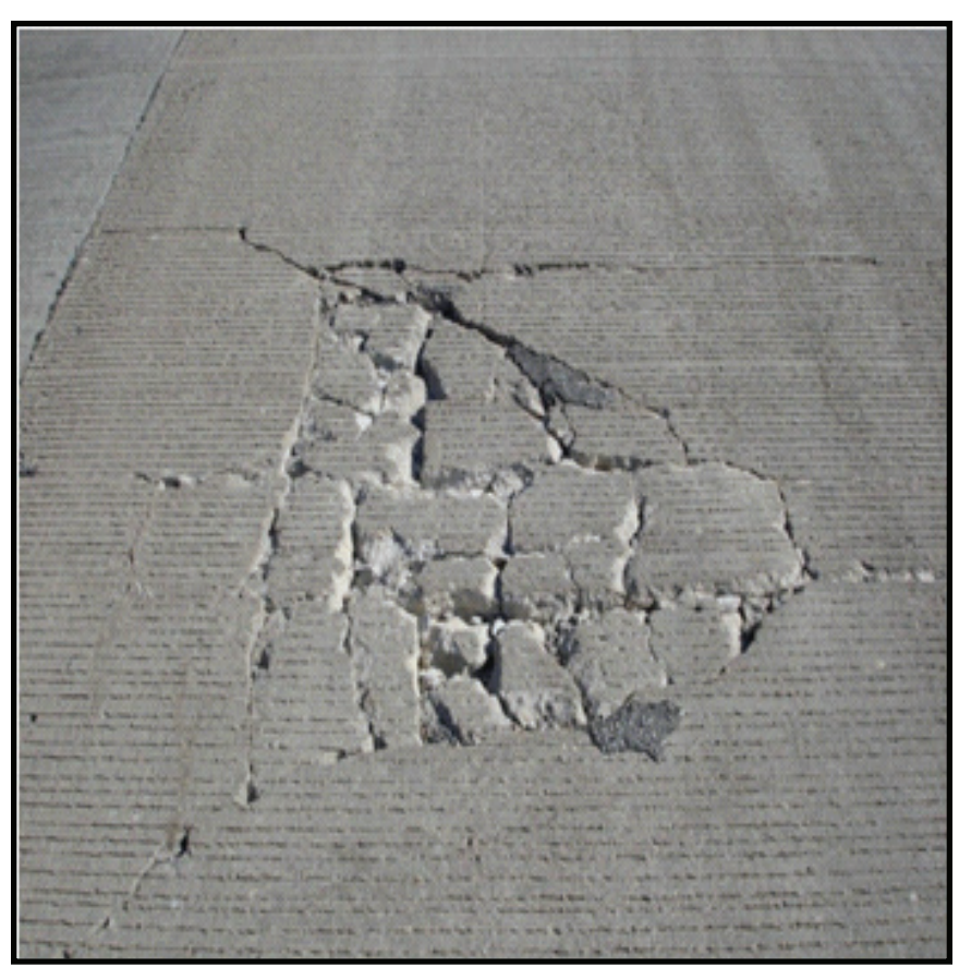
Figure 3. Partial depth distress under wheel path with fractured concrete