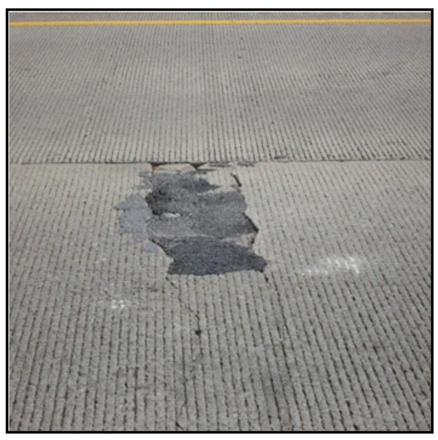
Figure 1. Partial depth distress near longitudinal construction joint