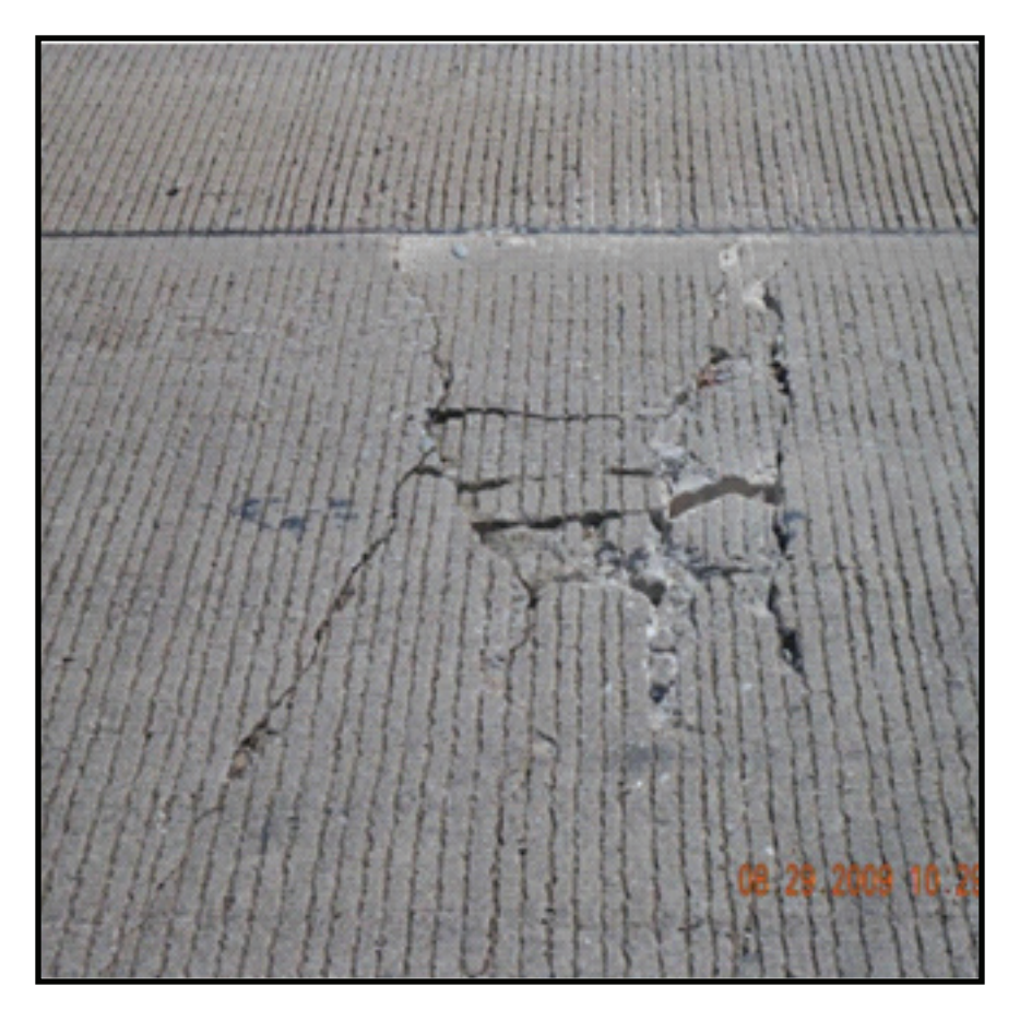
Figure 5. Partial depth distress under wheel path