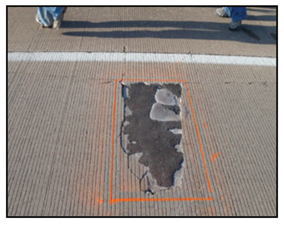
Figure 7. Boundary of PDR straight and clearly marked

Once the distress has been determined as a PDD, the boundary of the repair area has to be established. Unlike full depth distress, PDD is normally confined longitudinally by transverse cracks. Transversely, the boundary should contain all longitudinal cracks or fractured concrete. Accordingly, about 2 to 3 inches outside of the transverse cracks that confine the distress area can be the limit of PDR in the longitudinal direction. Repair limits for transverse direction must be beyond the distress area. Taking 1-in diameter cores can provide more definite information on the repair limits in the transverse direction. In addition, repair areas shall not be closer than 6-in to any other transverse crack or joint. The minimum size of the repair area should be 1-ft in both longitudinal and transverse directions. The boundaries thus determined are clearly marked for saw cutting operation as shown in Figures 6 and 7. The repair boundaries should be straight for the ease of saw cutting.