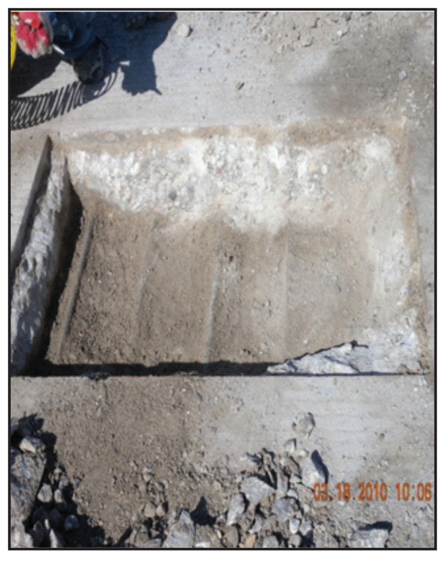
Figure 10. Large amount of fine materials at the bottom of the PDD