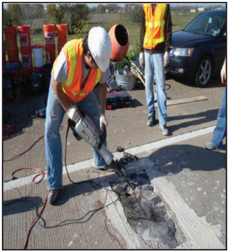
Figure 9. Removing concrete using a jackhammer