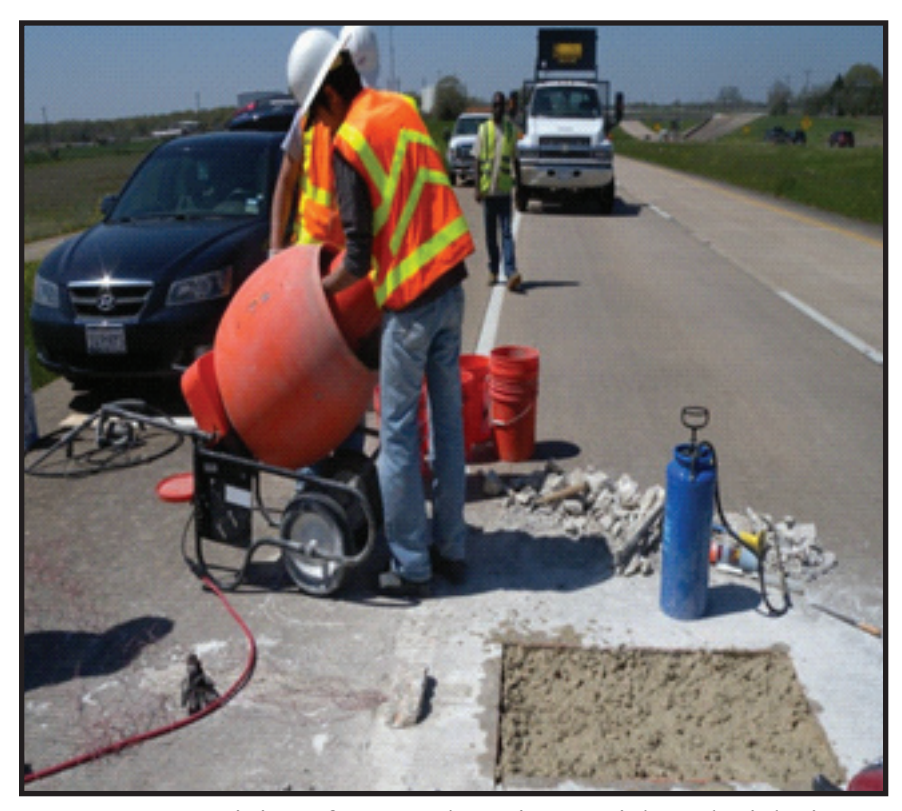
Figure 11. Mixing of prepared repair materials at the job site

If a maturity curve was not developed during the mix design stage, make a minimum of six 4-by-8 cylinders and cure them at the job site