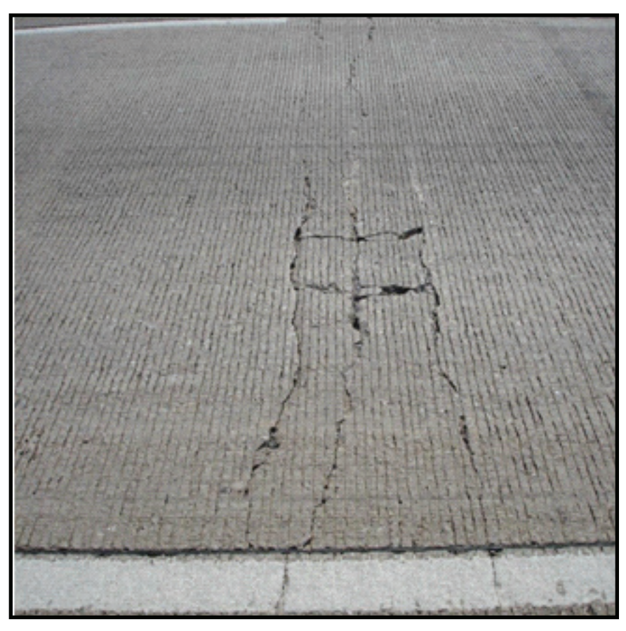
Figure 2. Partial depth distress under wheel path

In Figure 1, the distress is confined within two closely spaced transverse cracks. Note that there is no faulting at the longitudinal construction joint. The concrete within the distress fractured into smaller pieces and asphalt patching material was applied. In Figure 2, two longitudinal cracks occurred closely next to each other. Note that the two longitudinal cracks occurred within three closely spaced transverse cracks. No faulting is observed at the longitudinal construction joint.