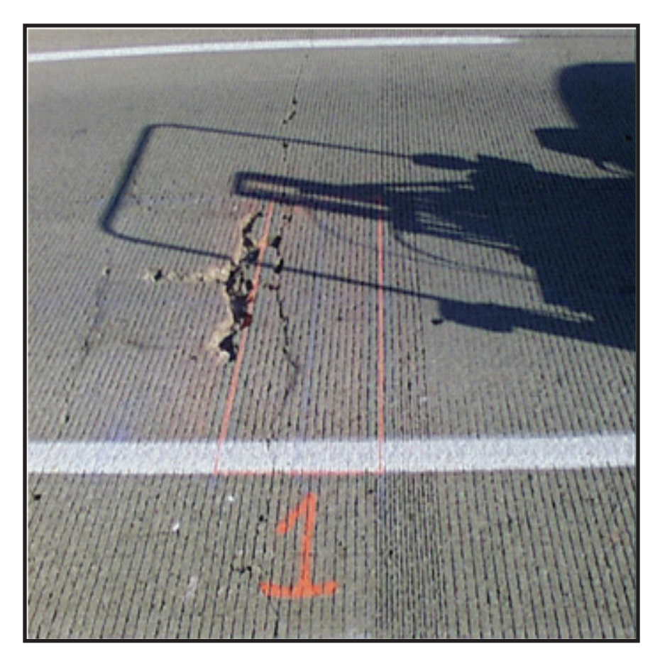
Figure 6. Partial depth distress under wheel path

Figure 5 meets all three features described on page 3. Note the whitish material at the second transverse crack from the right. This material is calcium carbonate and is observed at PDD quite often. Figure 6 also shows no faulting at the longitudinal warping joint and several longitudinal cracks.