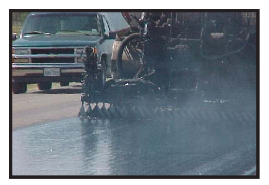
Figure 2. An Asphalt Distributor at Work

The size and production rates of distributors are on the increase, and the