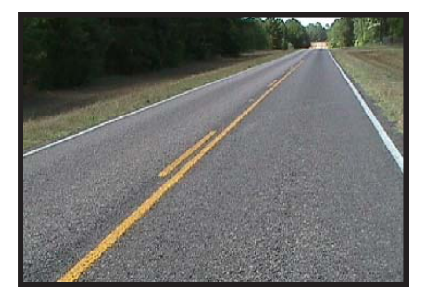
Figure 1. A Typical Texas Seal Coat

In some districts, seal coating is done to roads that require rehabilitation but for which funding is not