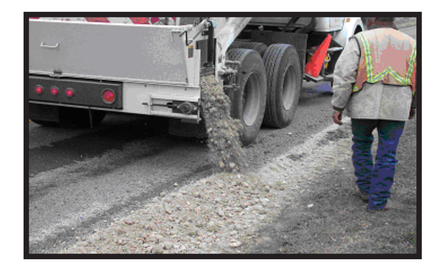
Figure 5. Edge maintenance equipment includes conventional, inhouse-modified, and commercially manufactured equipment specifically dealing with pavement edge drop-offs.

The primary benefit of this research has been a consolidation of over 3700 years of institutional knowledge regarding edge repair techniques and the dissemination of those "best practices" across the State of Texas. We recommend that the training program be continued as an ongoing implementation project in order to communicate best practices for pavement edge maintenance to all appropriate audiences within TxDOT, maintenance and otherwise.