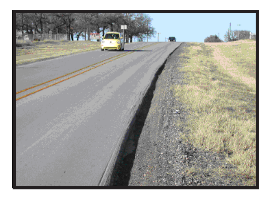
Figure 2. Maintenance personnel define edge drop-offs in risk-based terms with respect to two functional criteria: 1) the impact on safety of the traveling public, and 2) the potential for damage to the road.

specification incorporates current repair specifications, both from TxDOT and elsewhere, and contains recommendations for its application with regard to project type, location, environment, traffic volume, etc.