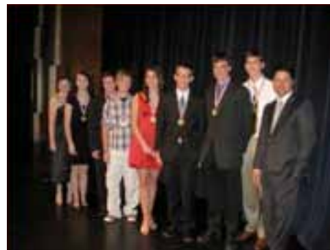
Regional One Act Play Winners