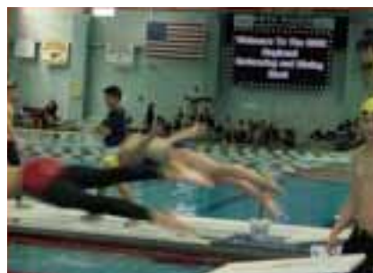
Swimming and Diving Meet